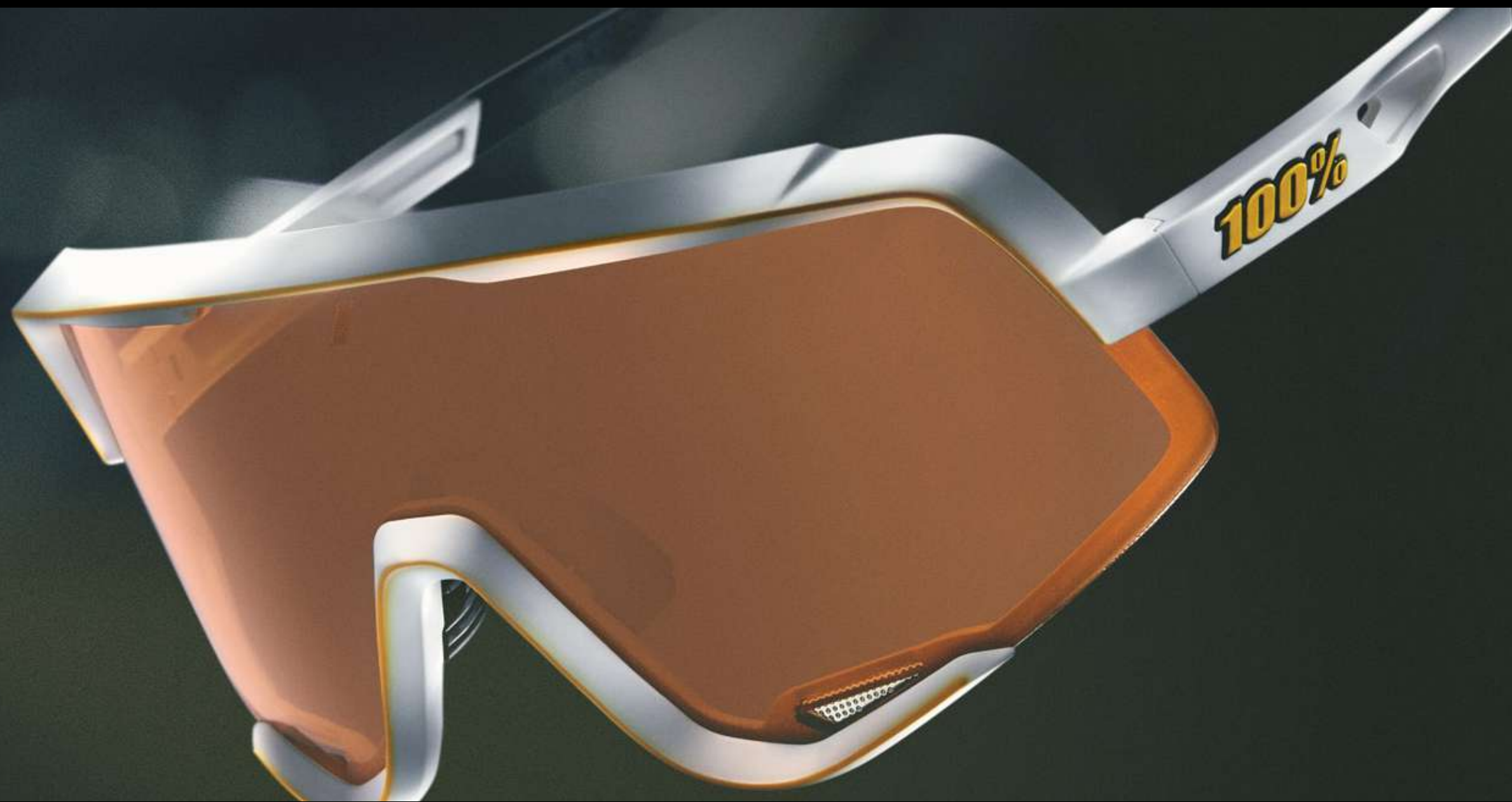
"The Glendale" Soft Tact White, with Persimmon Lens.