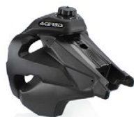
FC:16-18, FX/FE:17-19-4.1 GAL.