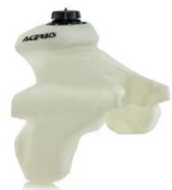
FC:16-18, FX/FE:17-19-3.1 GAL.

Acerbis fuel tanks provide additional fuel capacity while still providing slim ergonomics and sleek styling. Impact and abrasion resistant Polyurethane provides years of service with proper care. All Acerbis fuel tanks include Acerbis gas cap, mounting kit, and vent hose. Applications that require special fuel Y-fittings, petcocks, etc. will come with the tank. EFI tanks do NOT come with the fuel pump; they are designed to accept the stock one.