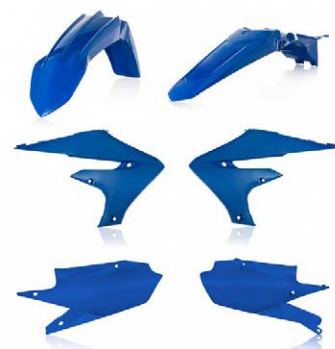
YZ250F:19 YZ450F:18-19 BLUE-2685910003