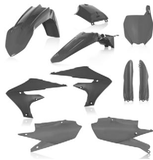
YZ450: 18-19 YZ250F:19 ORIGINAL '18- 2736350011