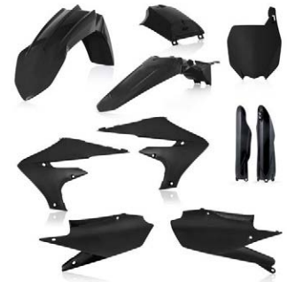
YZ450: 18-19 YZ250F:19 BLACK- 2736350001