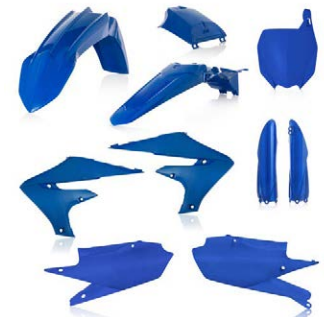
YZ450: 18-19 YZ250F:19 BLUE- 2736350003