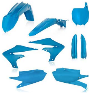
YZ450F:18 LIGHT BLUE- 2685920085