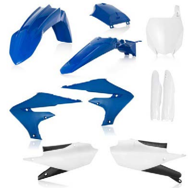
YZ450: 18-19 YZ250F:19 ORIGINAL 18-19'- 2736356345

Learn more about motorcycle parts we have.