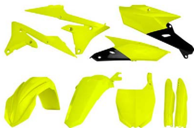
YZ250F:14-18 YZ450F:14-17 FLO-YELLOW-2374184310

• Colors marked with "original" correspond with the original factory colors of this model/year.