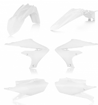
YZ250F:19 YZ450F:18-19 WHITE-2685910002