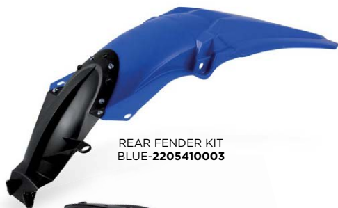
REAR FENDER KIT BLUE-2205410003