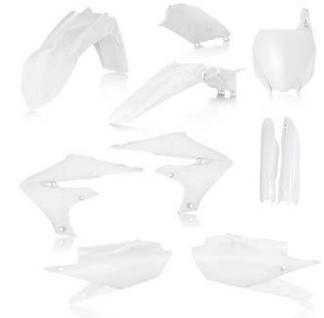
YZ450: 18-19 YZ250F:19 WHITE- 2736350002