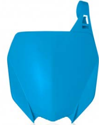
LIGHT BLUE 26858600085