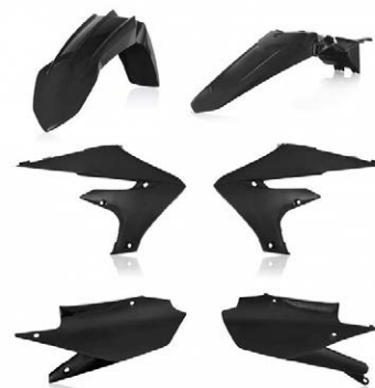
YZ250F:19 YZ450F:18-19 BLACK-2685910001