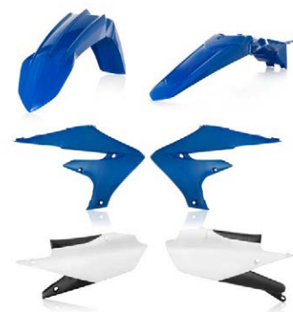
YZ250F:19 YZ450F:18-19 ORIGINAL '18-2685915909