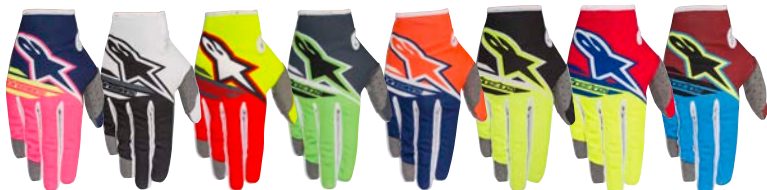
DARK BLUE PINK FLUO WHITE // 7032 WHITE BLACK // 21 YELLOW FLUO RED ANTHRACITE // 539 ANTHRA- CITE GREEN FLUO // 1460 ORANGE FLUO DARK BLUE WHITE // 473 BLACK YELLOW FLUO // 155 RED YELLOW FLUO BLUE // 356 RIO RED AQUA YELLOW FLUO // 3066