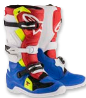
BLUE WHITE RED YELLOW FLUO // 7025