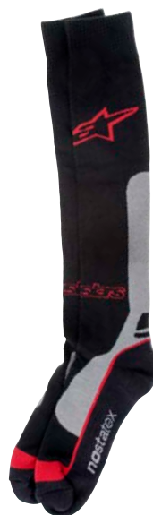
BLACK GRAY RED // 131