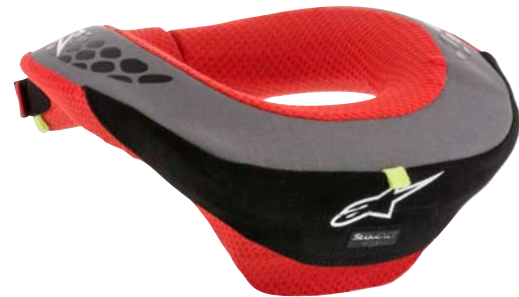
BLACK RED // 13