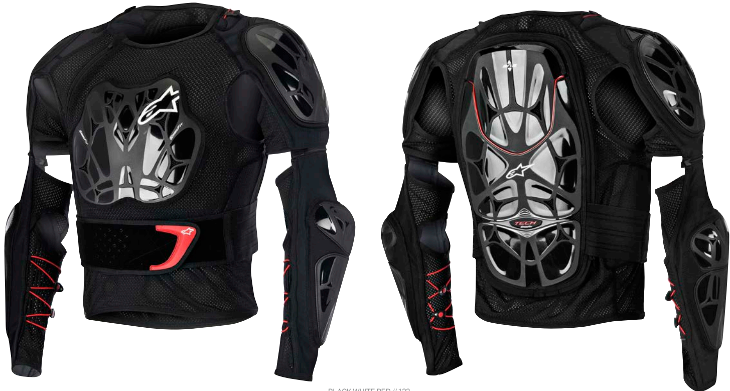
BLACK WHITE RED // 123