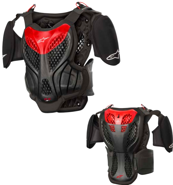
BLACK RED // 13