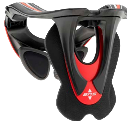
ANTHRACITE RED WHITE // 1430