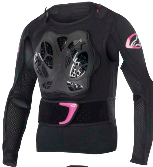
BLACK PURPLE // 1360