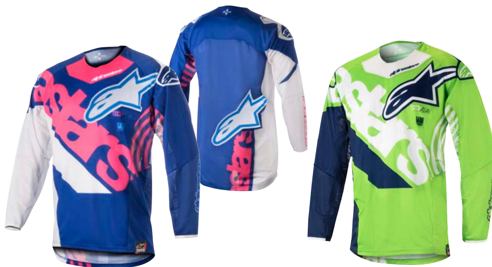
BLUE PINK FLUO WHITE // 7392