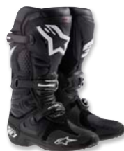
BLACK // 10