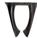
ATTACHMENT PLATE FOR BNS PRO 695 0114 10 BLACK ONE SIZE