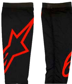
BLACK RED // 13