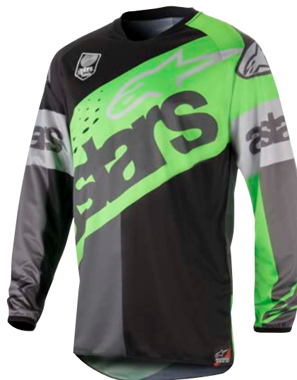
GREEN FLUO ANTHRACITE BLACK // 616