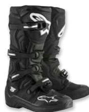
BLACK // 10