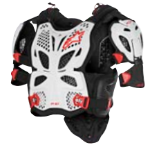
ANTHRACITE BLACK RED // 1431