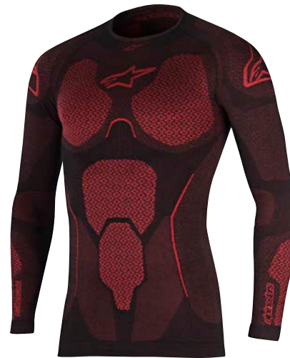
TOP 475 2517 BLACK RED // 13