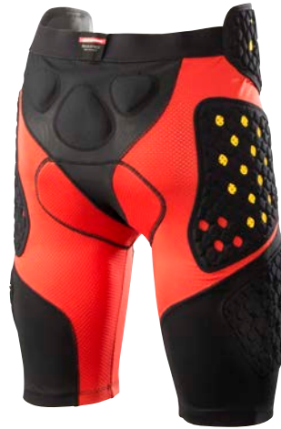
BLACK RED // 13