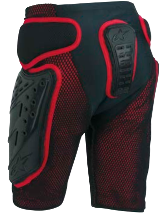
BLACK RED // 13