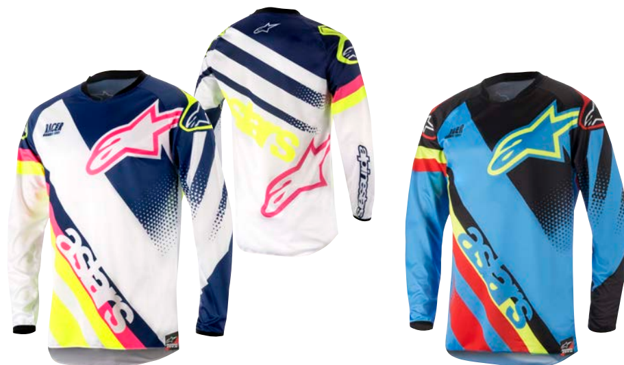
WHITE DARK BLUE YELLOW FLUO // 227