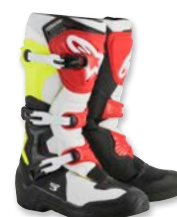
BLACK WHITE YELLOW FLUO RED // 1053