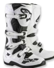
WHITE BLACK // 21