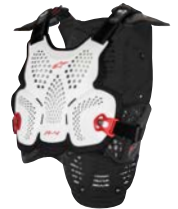
WHITE BLACK RED // 213