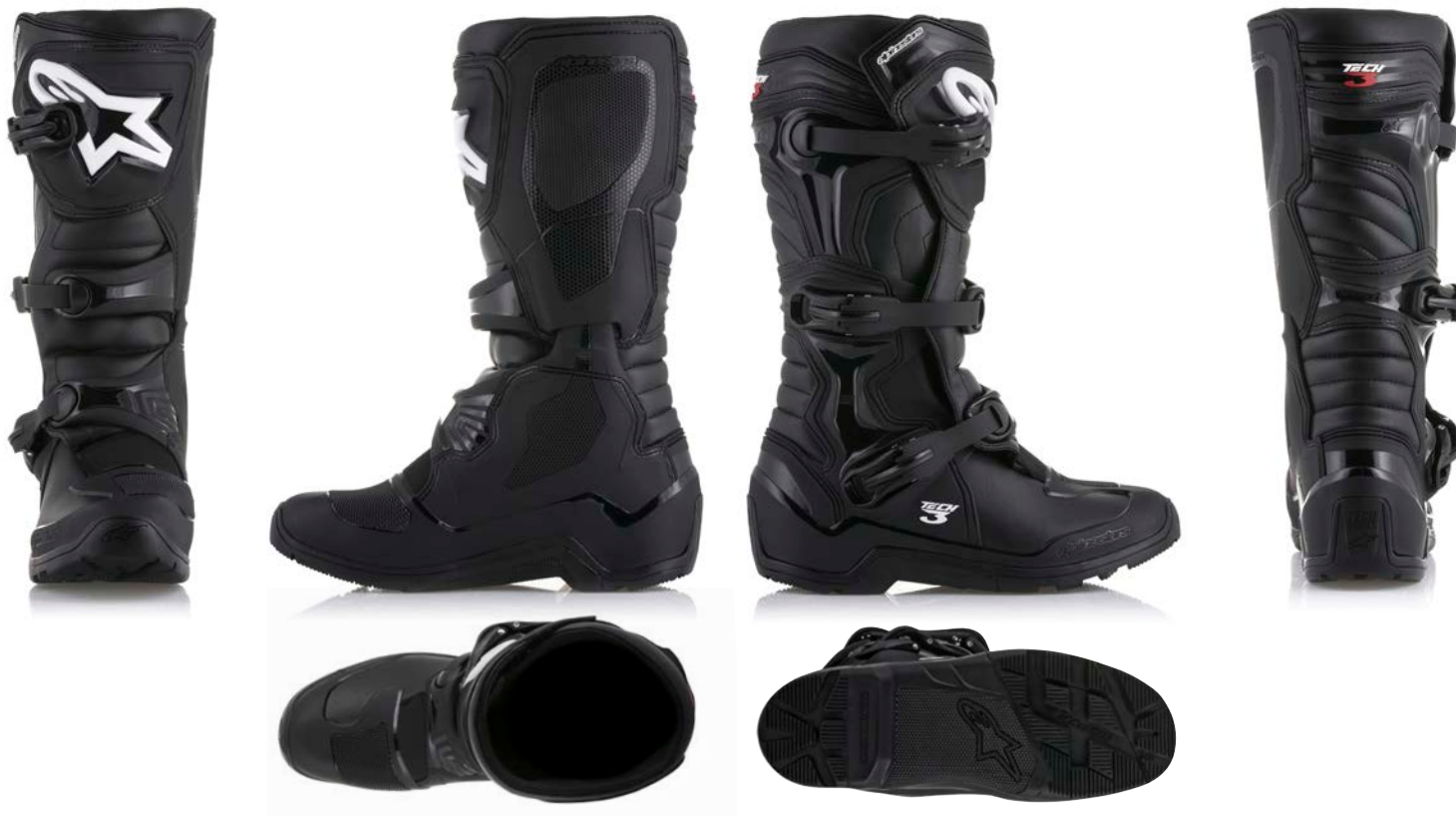
BLACK // 10