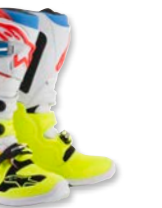
BLACK RED YELLOW // 136