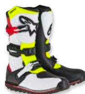
WHITE RED YELLOW FLUO BLACK // 2351