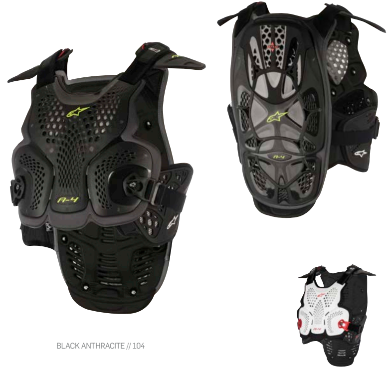
BLACK ANTHRACITE // 104