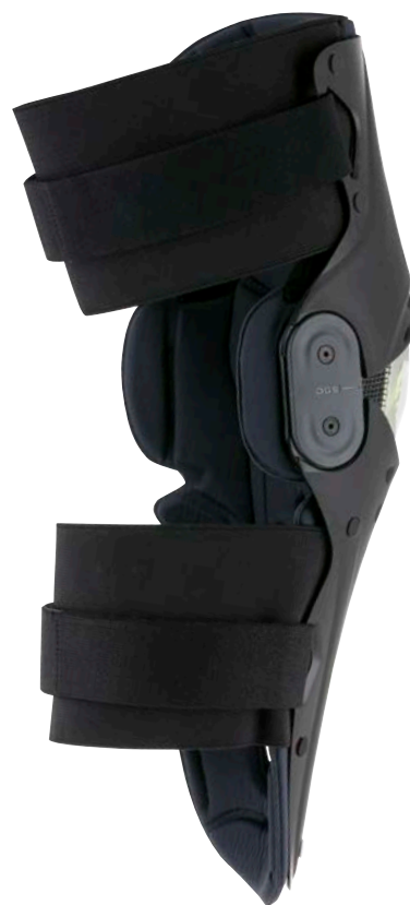
BLACK ANTHRACITE // 104