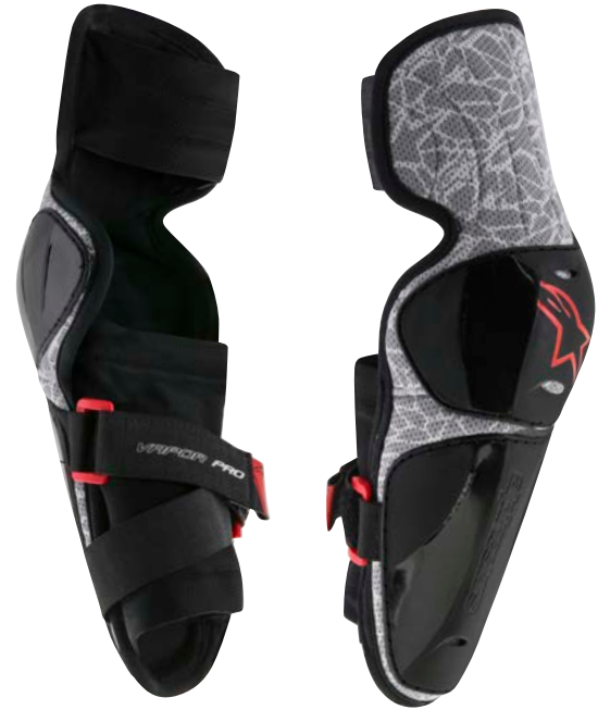
BLACK GRAY // 106