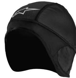
BLACK // 10