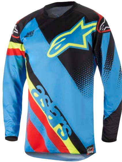
AQUA BLACK RED // 7113