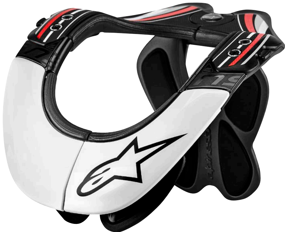
BLACK WHITE RED// 123