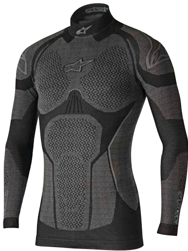
TOP 475 2117 BLACK GRAY // 106