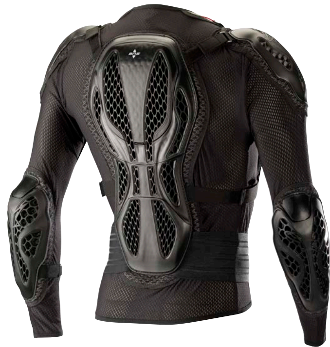
BLACK RED // 13