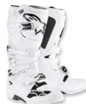
WHITE // 20