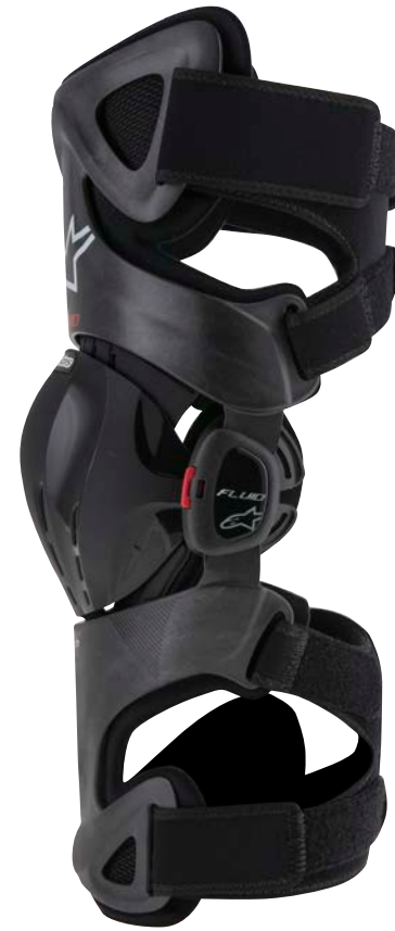
ANTHRACITE RED WHITE // 1430