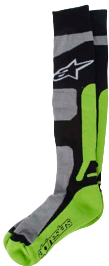
GRAY BLACK GREEN // 916