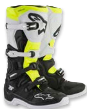
BLACK WHITE YELLOW FLUO // 125