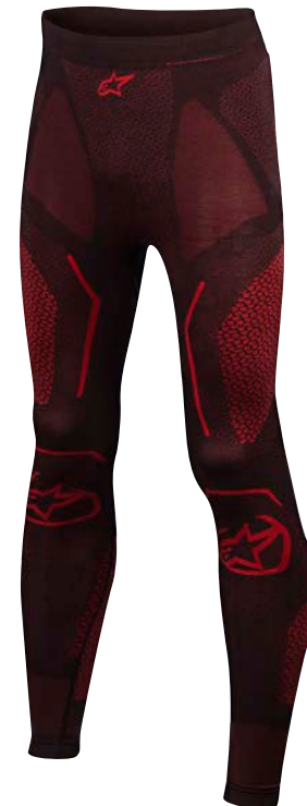
BOTTOM 475 2617 BLACK RED // 13