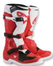
RED WHITE // 32