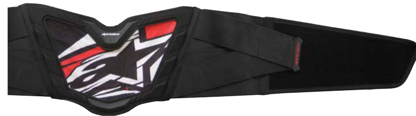
BLACK RED // 13