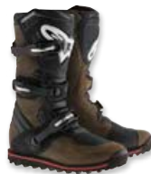
BROWN OILED // 818