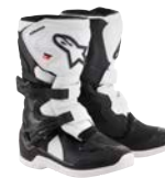
BLACK WHITE // 12