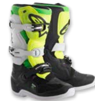
BLACK WHITE YELLOW FLUO GREEN FLUO // 1025