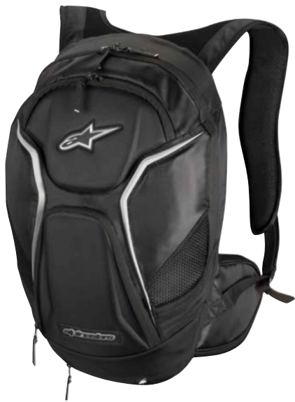
BLACK WHITE // 12