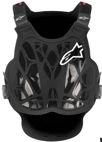
BLACK WHITE RED // 123