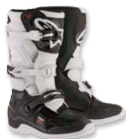
BLACK WHITE // 12