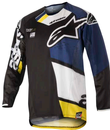
BLACK DARK BLUE WHITE YELLOW // 1725