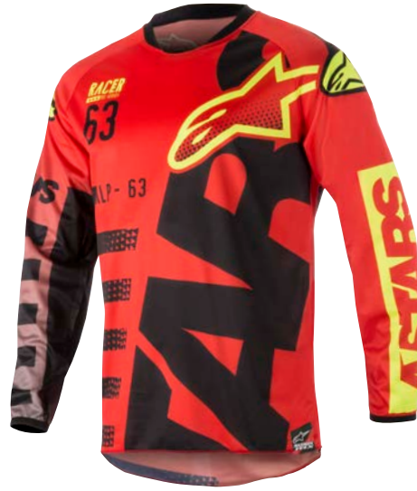
RED BLACK YELLOW FLUO // 316