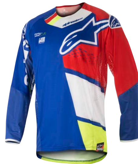
BLUE RED WHITE YELLOW FLUO // 7325