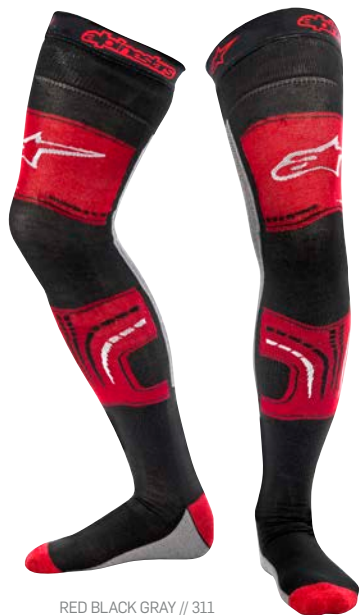
RED BLACK GRAY // 311