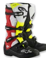
BLACK WHITE RED YELLOW FLUO // 1235