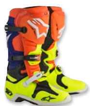
ORANGE FLUO BLUE WHITE YELLOW FLUO // 475