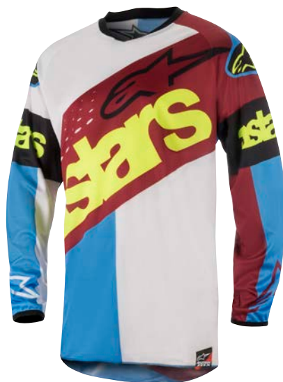
RIO RED AQUA WHITE // 3062