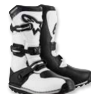
WHITE BLACK // 21