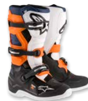
BLACK ORANGE WHITE BLUE // 1427