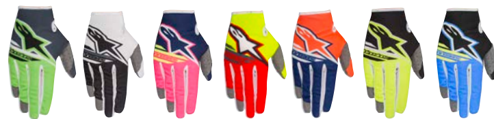
ANTHRACITE GREEN FLUO // 1460 WHITE BLACK // 21 DARK BLUE PINK FLUO WHITE // 7032 YELLOW FLUO RED ANTHRACITE // 539 ORANGE FLUO DARK BLUE WHITE // 473 BLACK YELLOW FLUO // 155 BLACK AQUA YELLOW FLUO // 1175