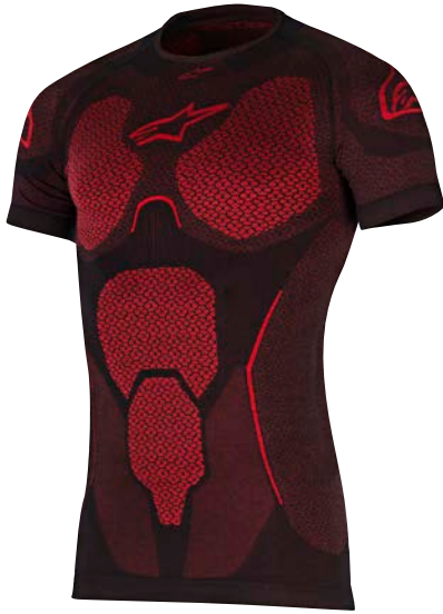
BLACK RED // 13