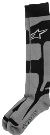
GRAY BLACK WHITE // 107