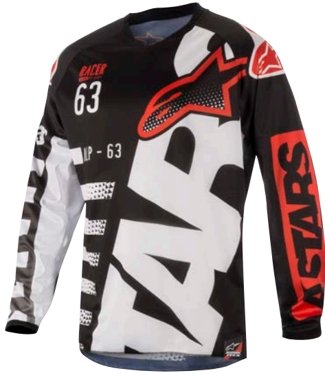
BLACK WHITE RED // 123