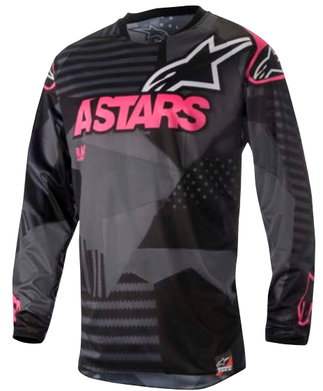
BLACK PINK FLUO // 1390