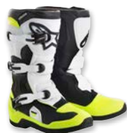
BLACK WHITE YELLOW FLUO // 125