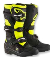
BLACK YELLOW FLUO // 155