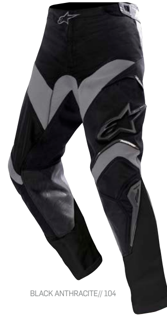
BLACK ANTHRACITE// 104