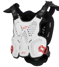
WHITE BLACK RED // 213