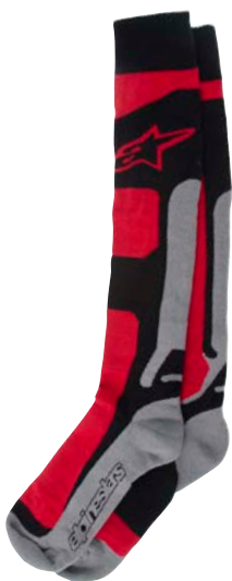
RED BLACK GRAY // 311