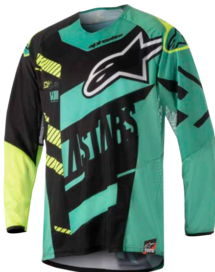
BLACK TEAL YELLOW FLUO // 1074