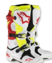
WHITE RED YELLOW FLUO VENTED // 236