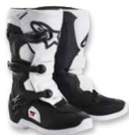
BLACK WHITE // 12