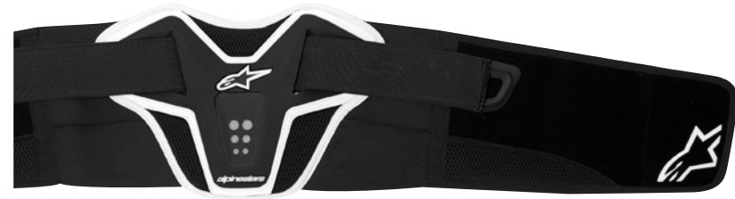
BLACK WHITE // 12