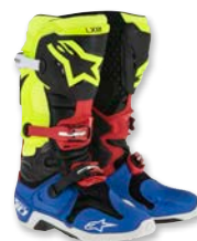
BLACK YELLOW FLUO BLUE RED // 1537