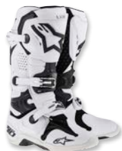
WHITE VENTED // 20