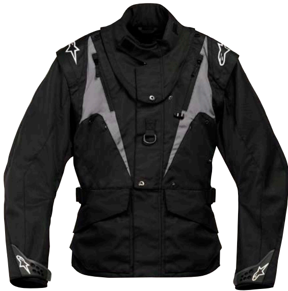
BLACK ANTHRACITE// 104