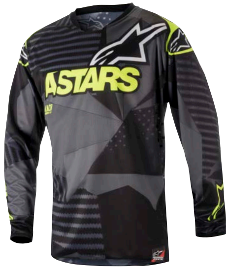
BLACK YELLOW FLUO // 155