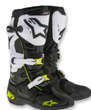
BLACK WHITE // 12