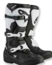
BLACK WHITE // 12