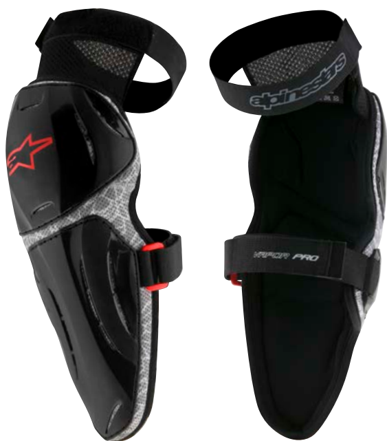
BLACK GRAY // 106