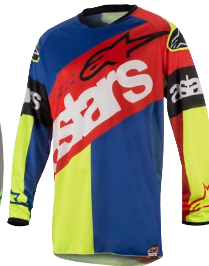
RED YELLOW FLUO BLUE // 356