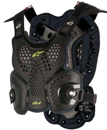
BLACK ANTHRACITE // 104