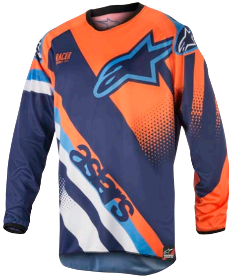
DARK BLUE ORANGE FLUO AQUA // 7049