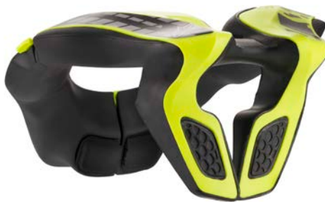
BLACK YELLOW FLUO // 155