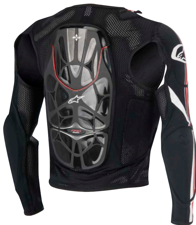
BLACK RED WHITE // 132