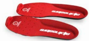
SIZE ADJUSTER FOOT BED TO REDUCE THE INTERNAL VOLUME BY ONE SIZE.