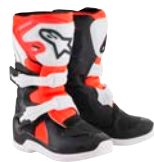
BLACK WHITE RED FLUO // 1231