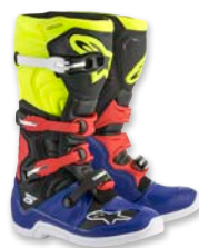
BLUE BLACK YELLOW FLUO RED // 7153