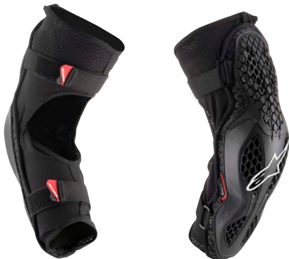
BLACK RED // 13