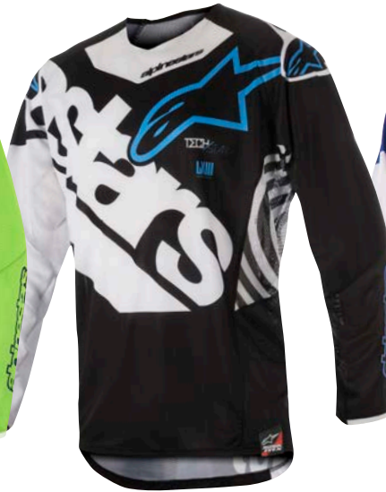
BLACK WHITE AQUA // 1279