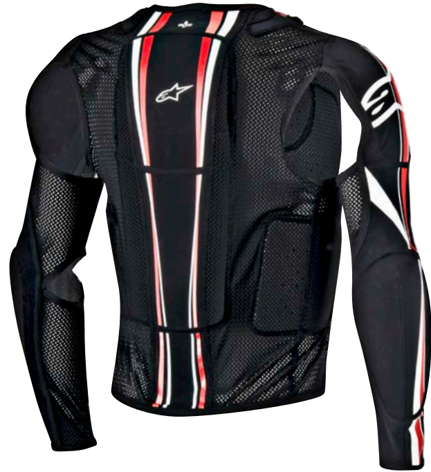
BLACK RED WHITE // 132