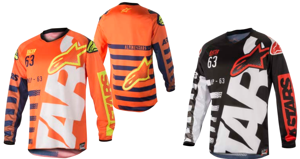
ORANGE FLUO DARK BLUE WHITE // 473