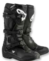
BLACK // 10