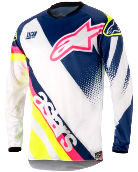
WHITE DARK BLUE YELLOW FLUO // 227