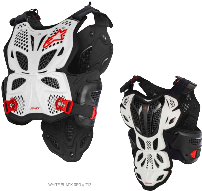
WHITE BLACK RED // 213