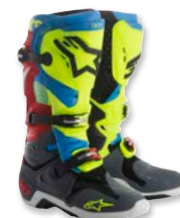
ANTHRACITE AQUA YELLOW FLUO RED // 1753