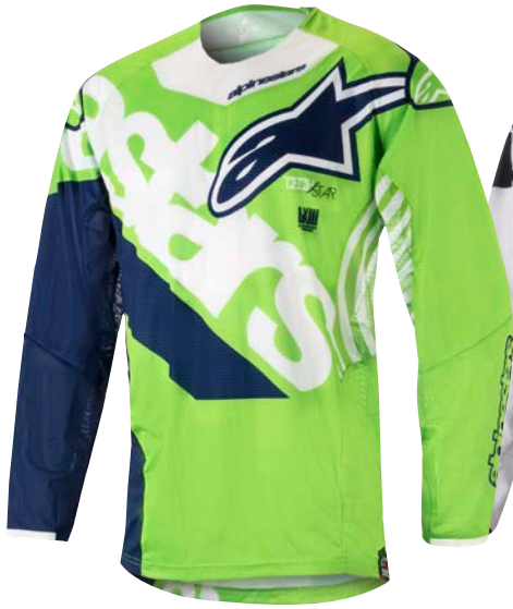
GREEN FLUO WHITE DARK BLUE // 629