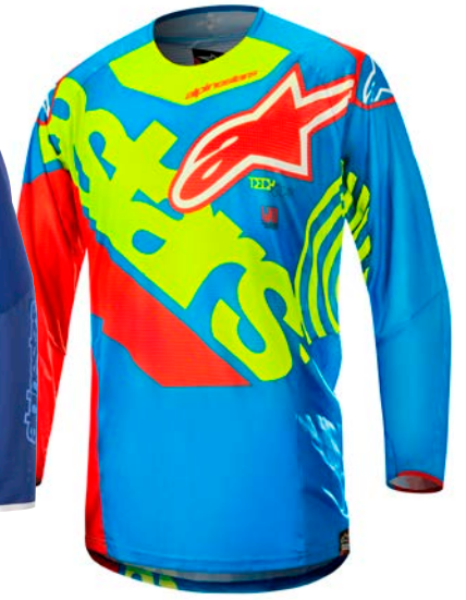
AQUA YELLOW FLUO RED // 7053