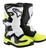
BLACK WHITE YELLOW FLUO // 125