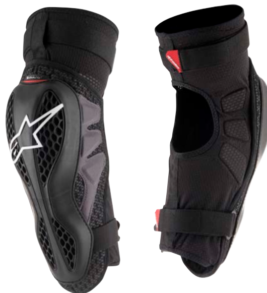
BLACK RED // 13