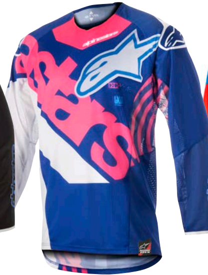
BLUE PINK FLUO WHITE // 7392