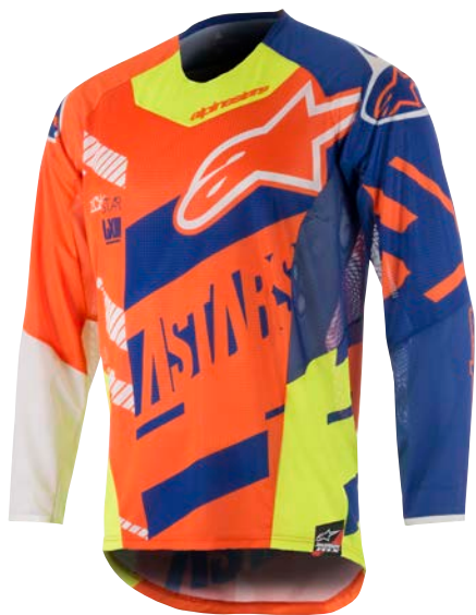
ORANGE FLUO BLUE WHITE YELLOW FLUO // 475