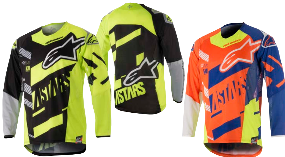
BLACK YELLOW FLUO GRAY // 1511