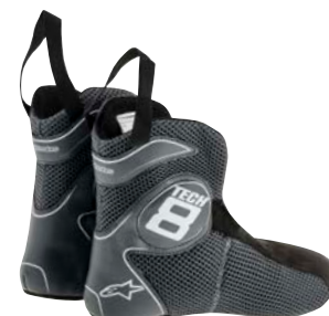
BLACK RED YELLOW FLUO WHITE // 1362