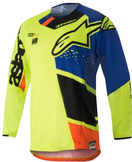
YELLOW FLUO BLUE BLACK ORANGE FLUO // 574