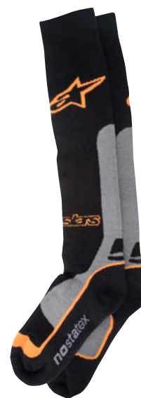
BLACK GRAY ORANGE // 174