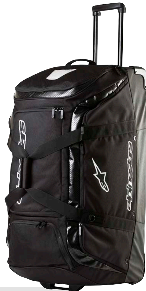
BLACK // 10