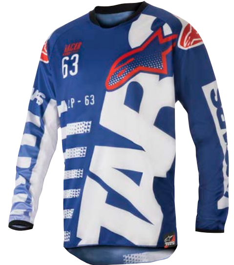
BLUE WHITE RED // 723