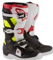
BLACK RED YELLOW FLUO // 136