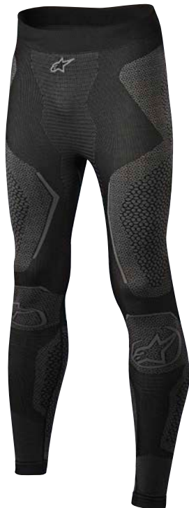
BOTTOM 475 2217 BLACK GRAY // 106