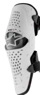
WHITE BLACK // 21