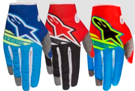
BLUE AQUA YELLOW FLUO // 7005 RED BLACK // 31 RED AQUA YELLOW FLUO // 3715