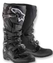
BLACK // 10