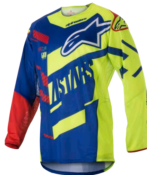
BLUE YELLOW FLUO RED // 754