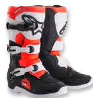
BLACK WHITE RED FLUO // 1231