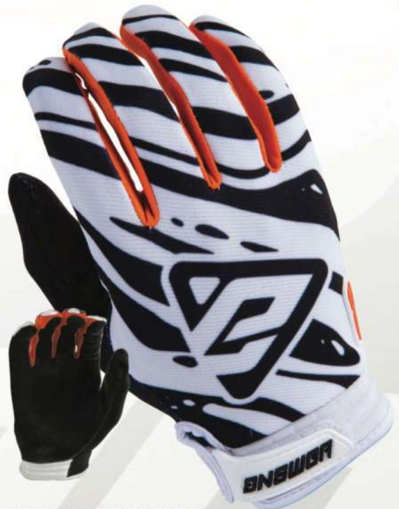
AR3 - WHITE / BLACK / ORANGE