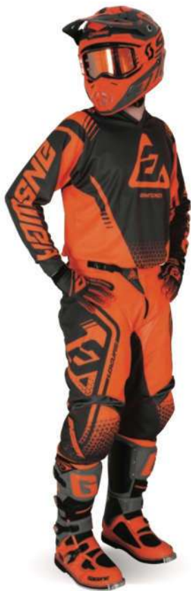
FLO ORANGE / CHARCOAL

If you are looking for performance racewear at an affordable price, then look no further. This year's synchron line has been redeveloped, race tested and rider approved by our own top pro athletes.