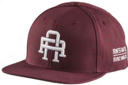
COLLEGIATE - PREMIUM CLASSIC SNAPBACK