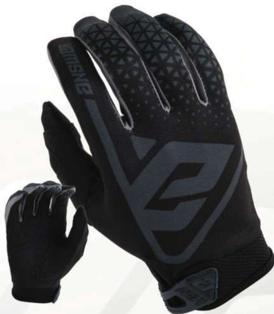
ARI - CHARCOAL / BLACK