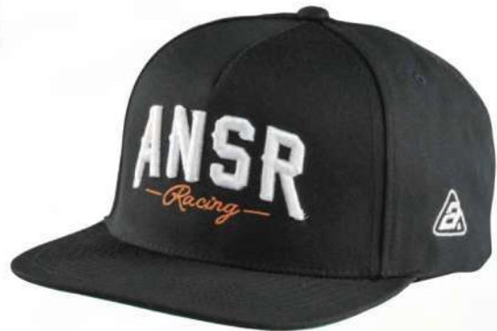
POINTS - PREMIUM SNAPBACK