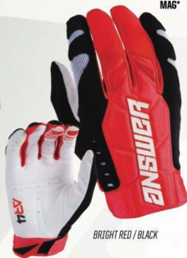
BRIGHT RED / BLACK