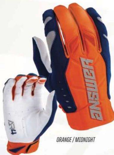
ORANGE / MIDNIGHT