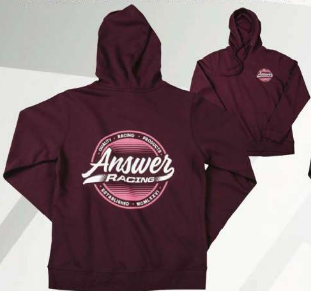
DERBY - MAROON