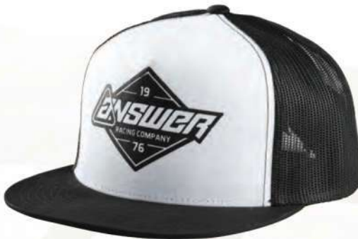
TRUCKIN - TRUCKER SNAPBACK