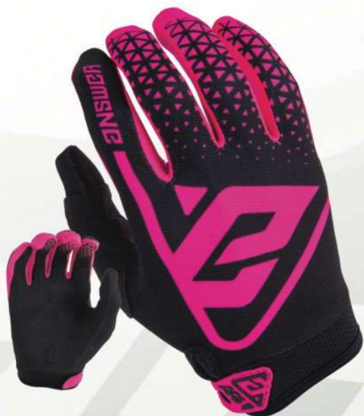
ARI WOMENS - FLO PINK / BLACK