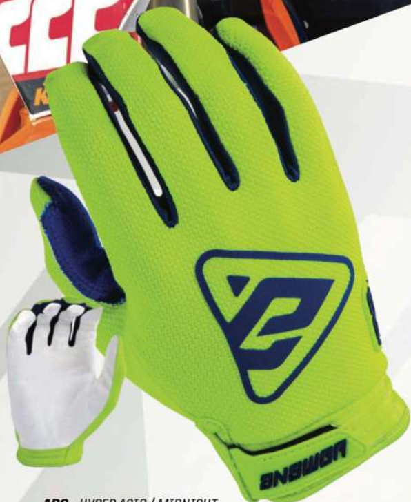
AR3 - HYPERACID / MIDNIGHT