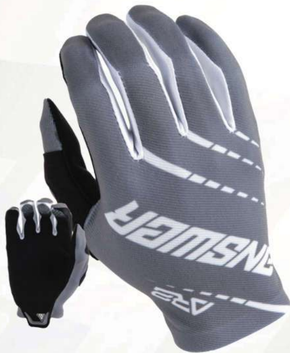
AR2 - STEEL