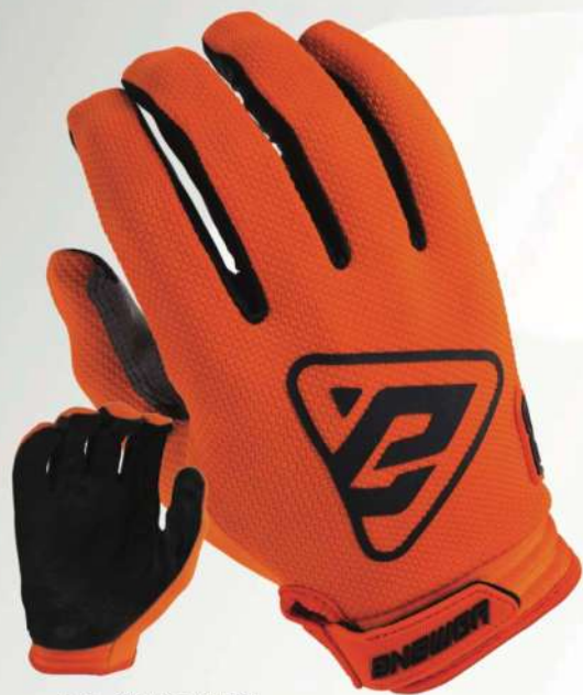
AR3 - ORANGE / BLACK