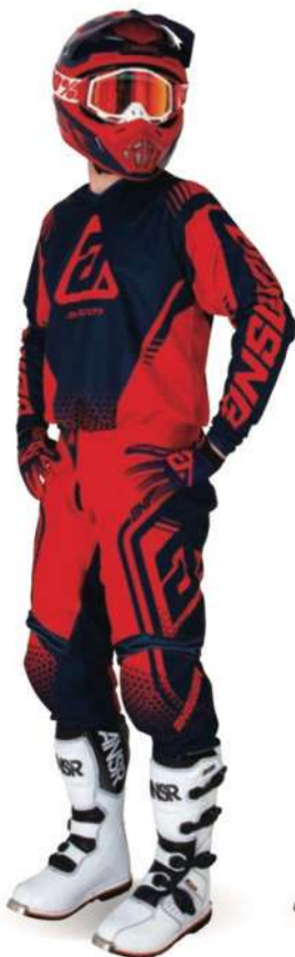
BRIGHT RED / MIDNIGHT