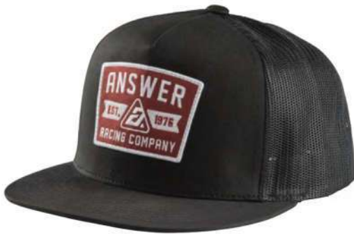
STANDARD - TRUCKER SNAPBACK