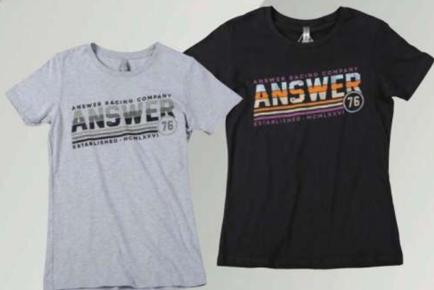
ASCEND - HEATHER GRAY