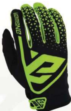
HYPER ACID / BLACK