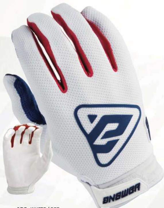
AR3 - WHITE / RED