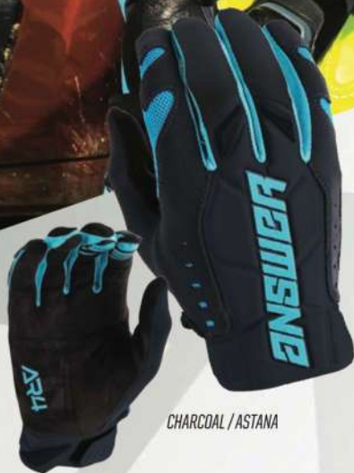
CHARCOAL / ASTANA