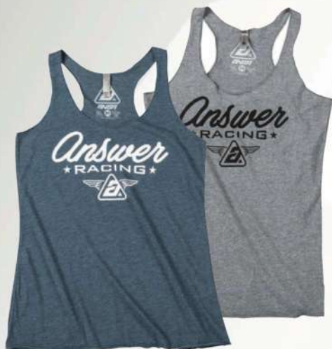
TEAM 76 - INDIGO