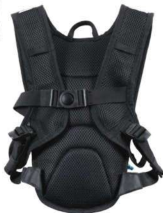
1.5L HYDRATION PACK