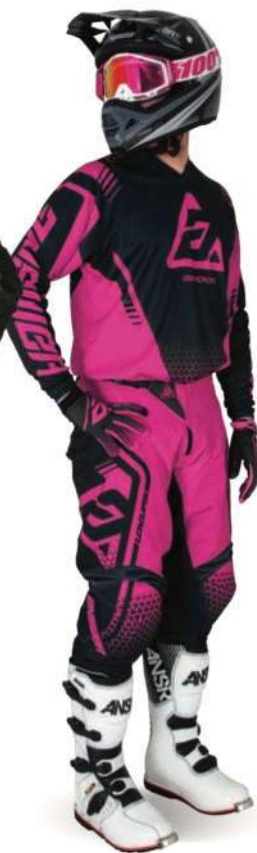
FLO PINK / BLACK