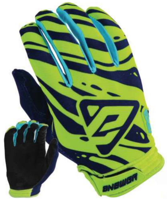
AR3 - HYPER ACID / MIDNIGHT / ASTANA