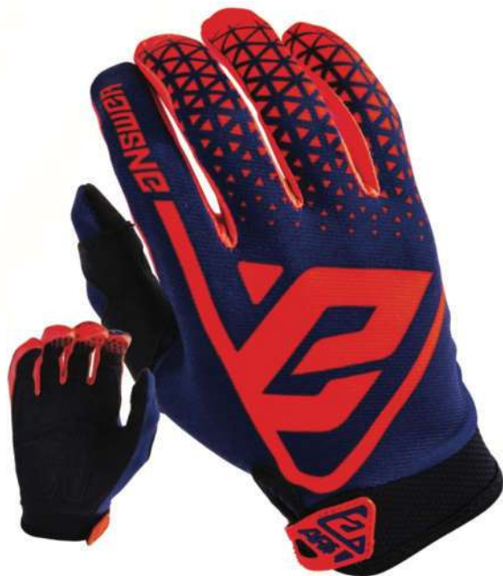
ARI - RED / MIDNIGHT