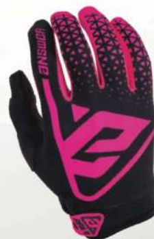
FLO PINK / BLACK