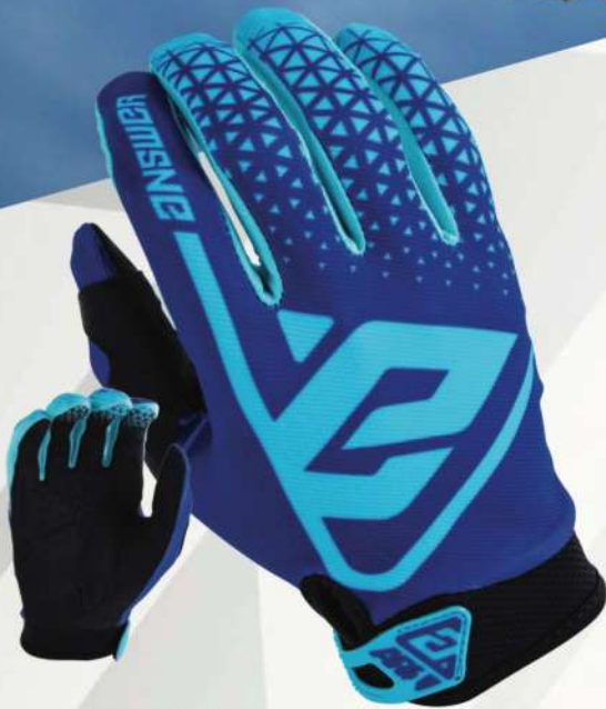
AR1 - REFLEX / ASTANA