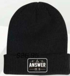
FLASH - BLACK