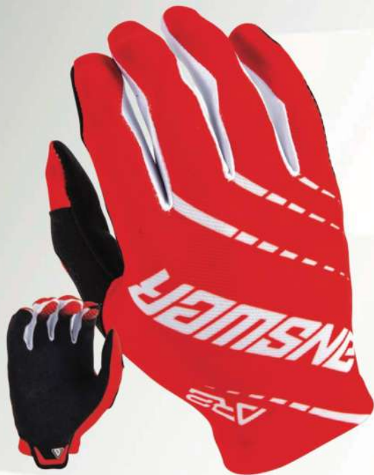
AR2 - BRIGHT RED