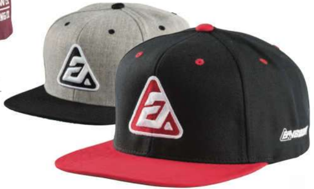
ICON - PREMIUM SNAPBACK