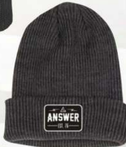
FLASH - CHARCOAL