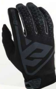
CHARCOAL / BLACK