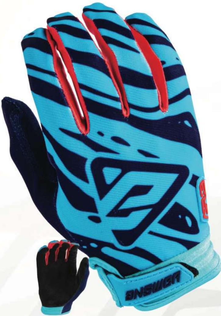
AR3 - ASTANA / INDIGO / BRIGHT RED