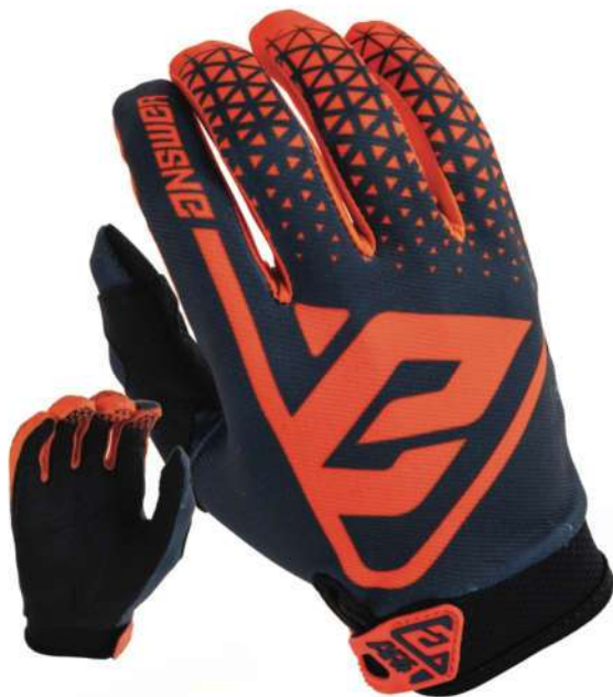
ARI - FLO ORANGE / CHARCOAL