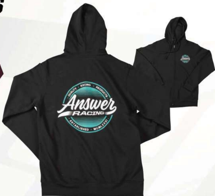
DERBY - BLACK