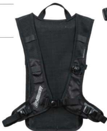
3.0L HYDRATION PACK