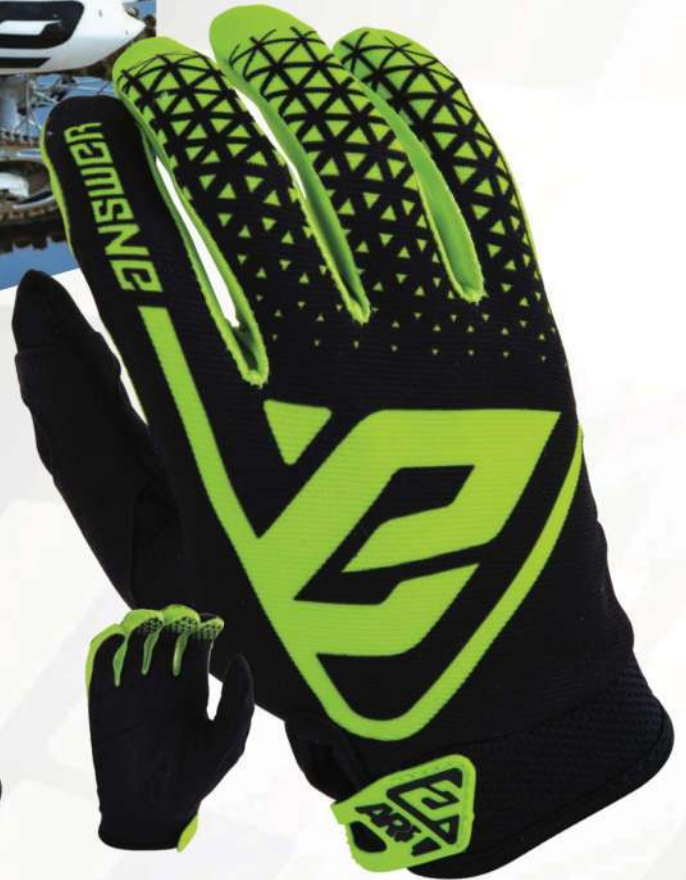
AR1 - HYPER ACID / BLACK