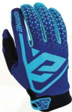
REFLEX / ASTANA