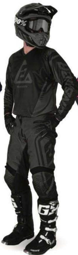
CHARCOAL / BLACK