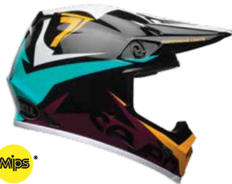
MX-9 MIPS SEVEN IGNITE GLOSS AQUA

CERTIFICATION: Snell, DOT, ECE SIZES: XS, S, M, L, XL, XXL