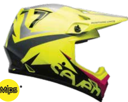
MX-9 MIPS SEVEN IGNITE GLOSS FLO YELLOW