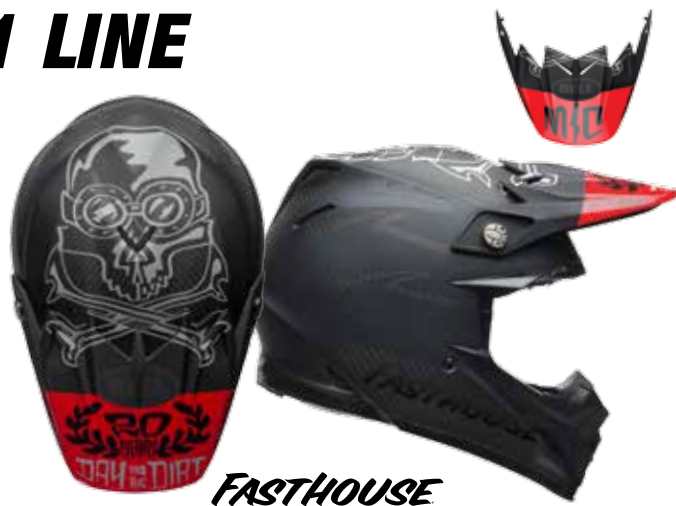
MOTO-9 FLEX FASTHOUSE DITD MATTE BLACK/RED (Additional Visor Included)

CERTIFICATION: DOT SIZES: XS, S, M, L, XL, XXL