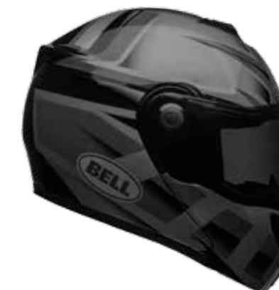
SRT MODULAR MATTE/GLOSS BLACKOUT (Additional Dark Smoke Shield Included)

CERTIFICATION: DOT, ECE SIZES: XS, S, M, L, XL, XXL, XXXL