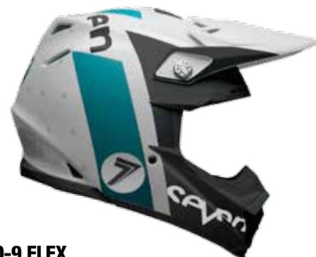
MOTO-9 FLEX SEVEN FLIGHT MATTE AQUA