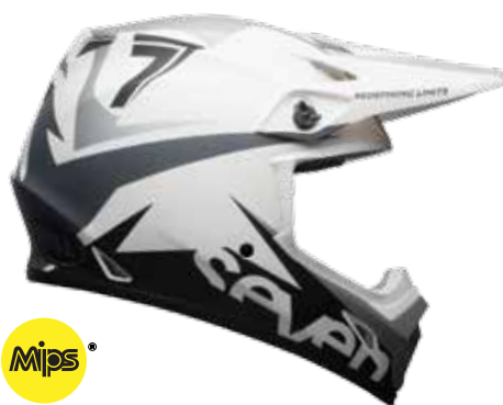
MX-9 MIPS SEVEN IGNITE MATTE WHITE