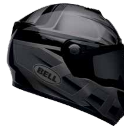
SRT MATTE/GLOSS BLACKOUT (Additional Dark Smoke Shield Included)

CERTIFICATION: DOT, ECE SIZES: XS, S, M, L, XL, XXL