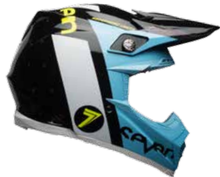
MOTO-9 FLEX SEVEN FLIGHT GLOSS BLACK