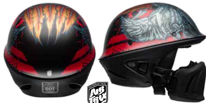
ROGUE AIRTRIX MATTE BLACK/RED/TITANIUM