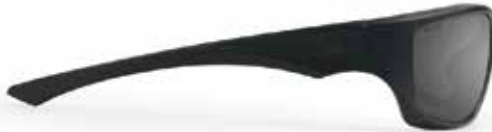
SKUS & Lens Options