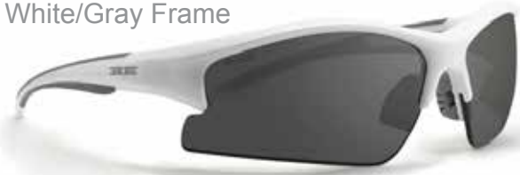
SKUS & Lens Options