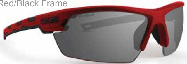
SKUS & Lens Options