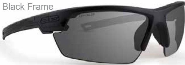
SKUS & Lens Options