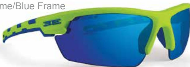
SKUS & Lens Options