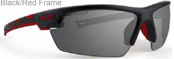
SKUS & Lens Options