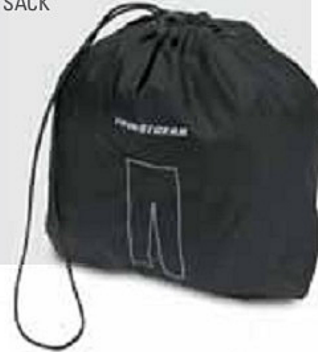
INTEGRATED PANT STUFF SACK

Waterproof-breathable, seam-taped nylon outer shell.