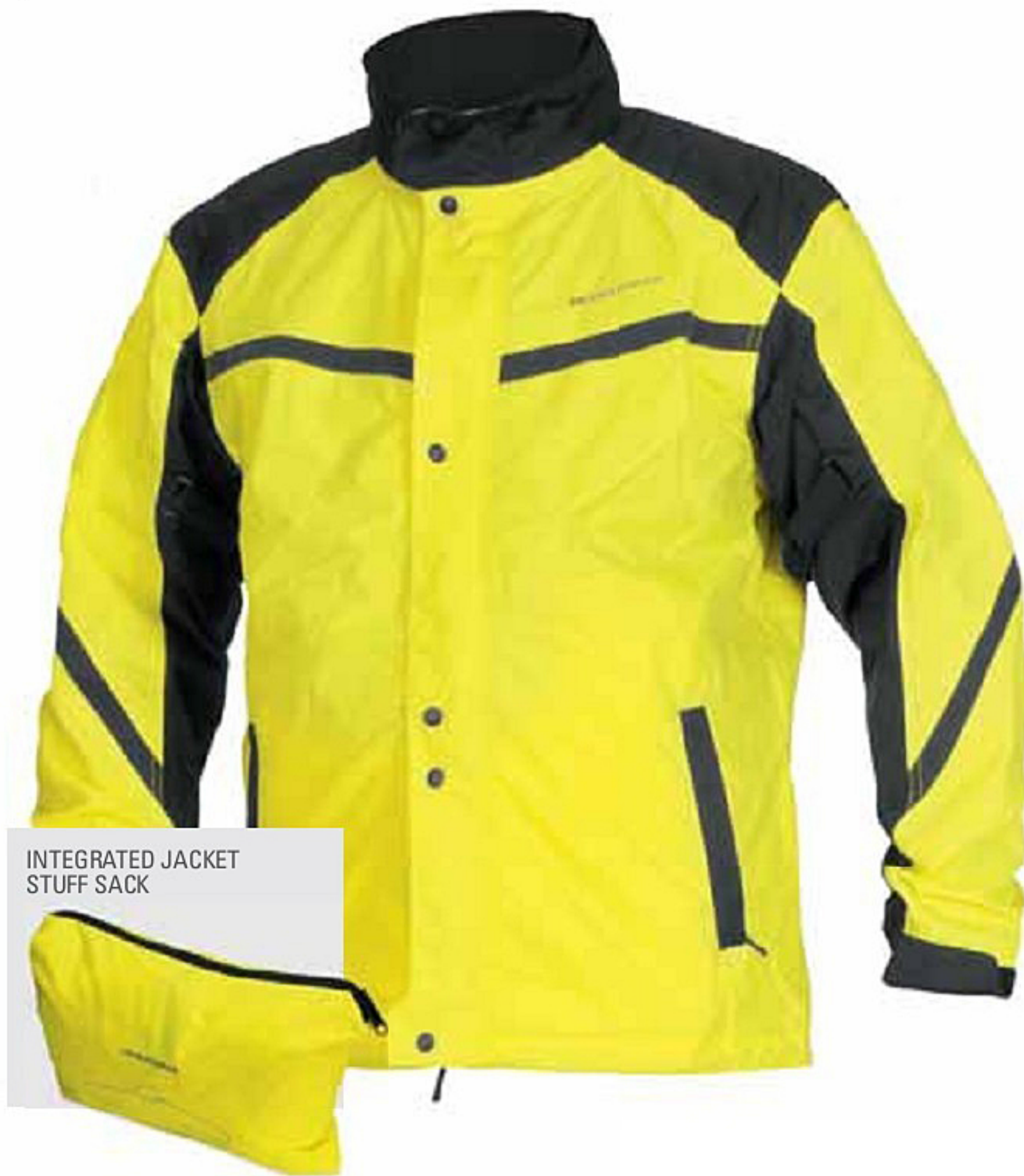
INTEGRATED JACKET STUFF SACK

Powerful DayGlo color provides outstanding visibility in low and rain-obscured lighting conditions. Fully seam-taped and easily stuffs into its own stuff sack, the Sierra is ideal for commuting and a great choice for long, wet days on the saddle.