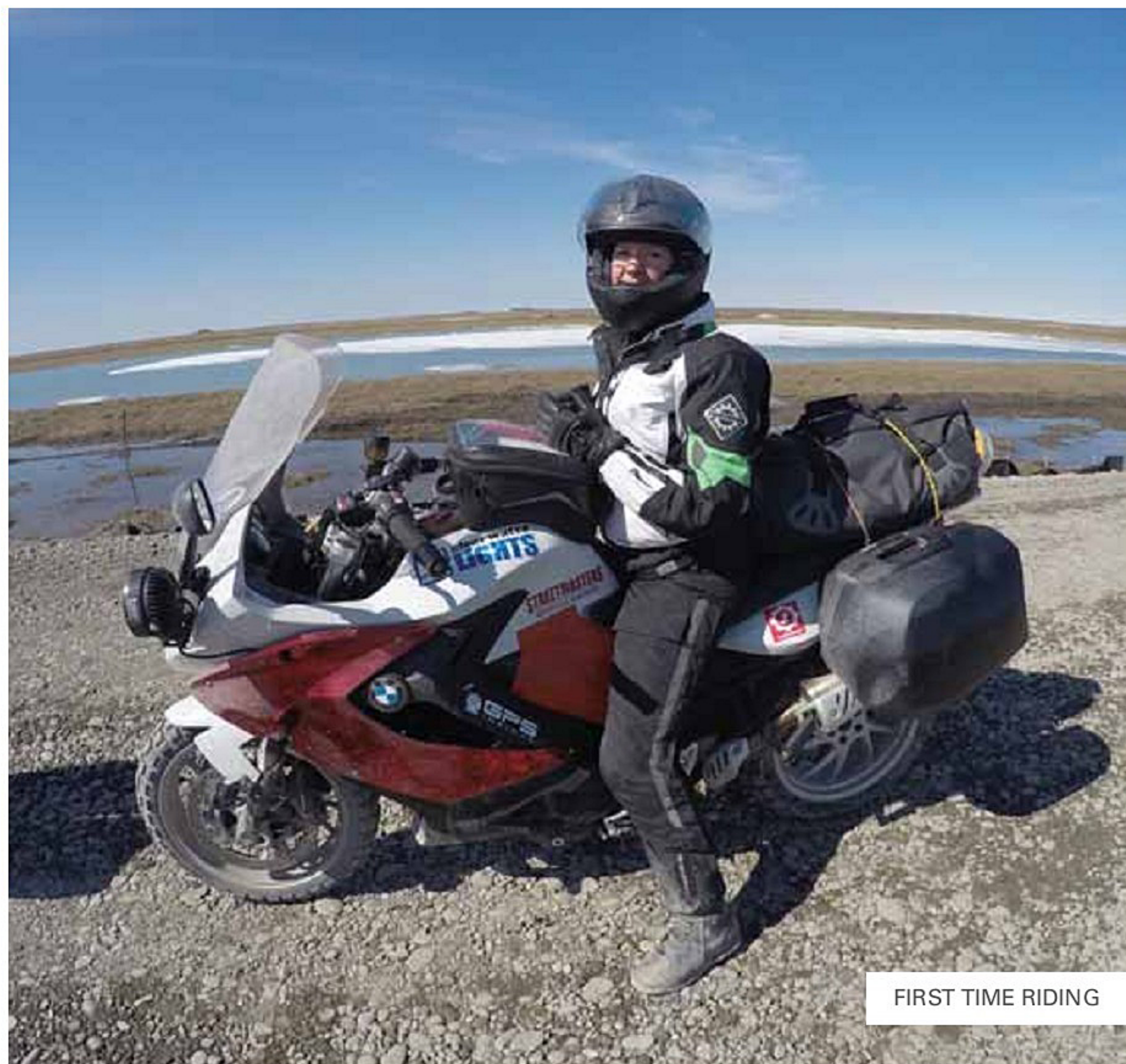
FIRST TIME RIDING

The FirstGear® 37.5° Kilimanjaro jacket is our newest, high-end, waterproof-breathable shell. Performance shell jackets are the perfect outerwear option to add to a rider's base layers to create an optimum microclimate. See more on pages 8 and 27.