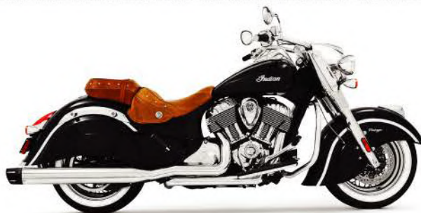
COMBAT 4 1/2" SLIP-ONS with FP Tuck & Under headers