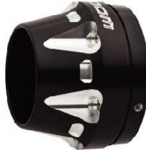
AMERICAN OUTLAW 4.5"

BLACK SCULPTED CUT [FP] AC00073 [TR] ] 47-3398 [WPS] 82-09101