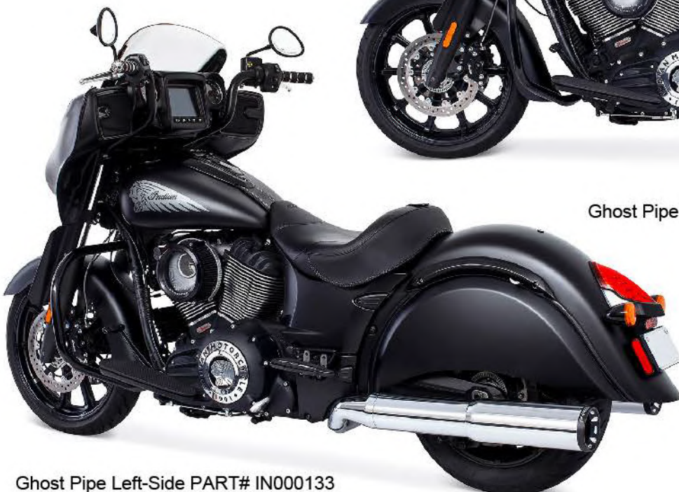
Ghost Pipe Left-Side PART# IN000133 Chrome with Black Sculpted Tip Complete System Right-Side PART# IN000153