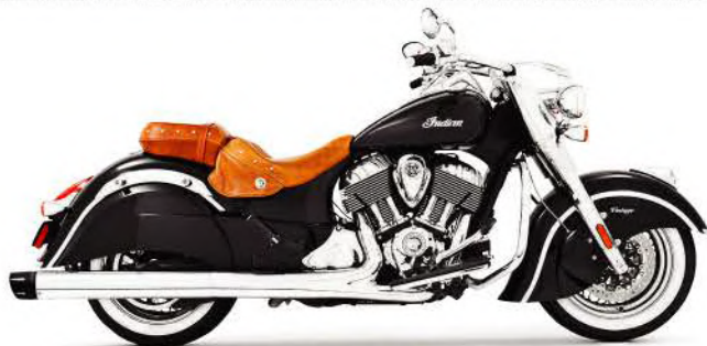
COMBAT 4-1/2" SLIP-ONS with OEM headers