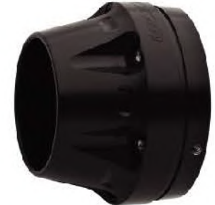
AMERICAN OUTLAW 4.5"

PITCH BLACK [FP] AC00074 [TR] ] 47-3399 [WPS] 82-09102