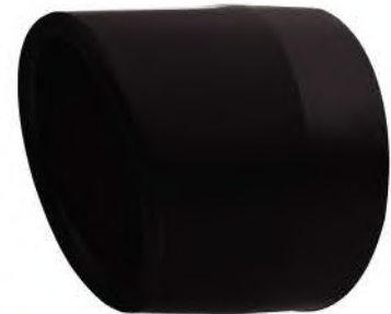
ROLLED EDGE 4"

PITCH BLACK [FP] AC00183 [TR] 47-3044 [WPS] CALL