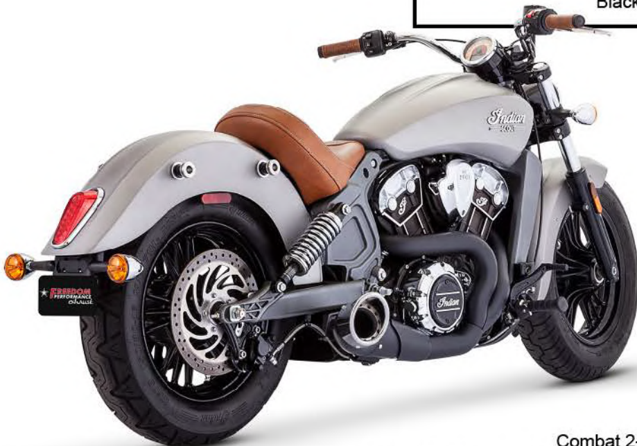
Combat 2-1 Turn-Out Black with Chrome End-Tip PART# IN000084