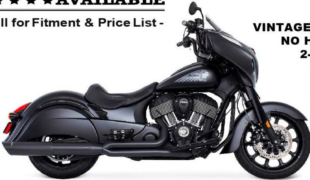
Complete System Right-Side PART# IN000149

INDIAN VINTAGE CLASSIC® NO HARD BAGS 2-1 with 4.5" SLASH TIP