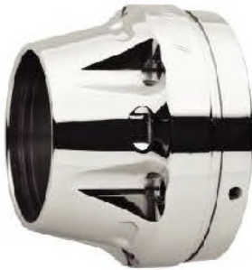
AMERICAN OUTLAW 4.5"

CHROME [FP] AC00072 [TR] ] 47-3397 [WPS] 82-09100