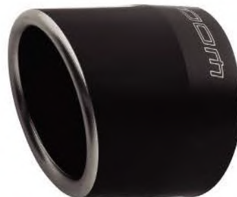
ROLLED EDGE 4"

BLACK SCULPTED CUT ea [FP] AC00102 [TR] CALL [WPS] CALL