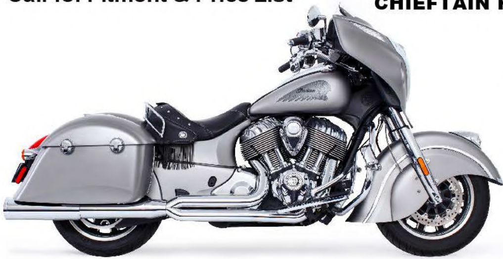
Complete System Right-Side PART# IN000162 Ghost Pipe PART# IN000162

INDIAN CHIEFTAIN ROADMASTER® HARD BAGS 2-1 with 4.5" STRAIGHT TIP