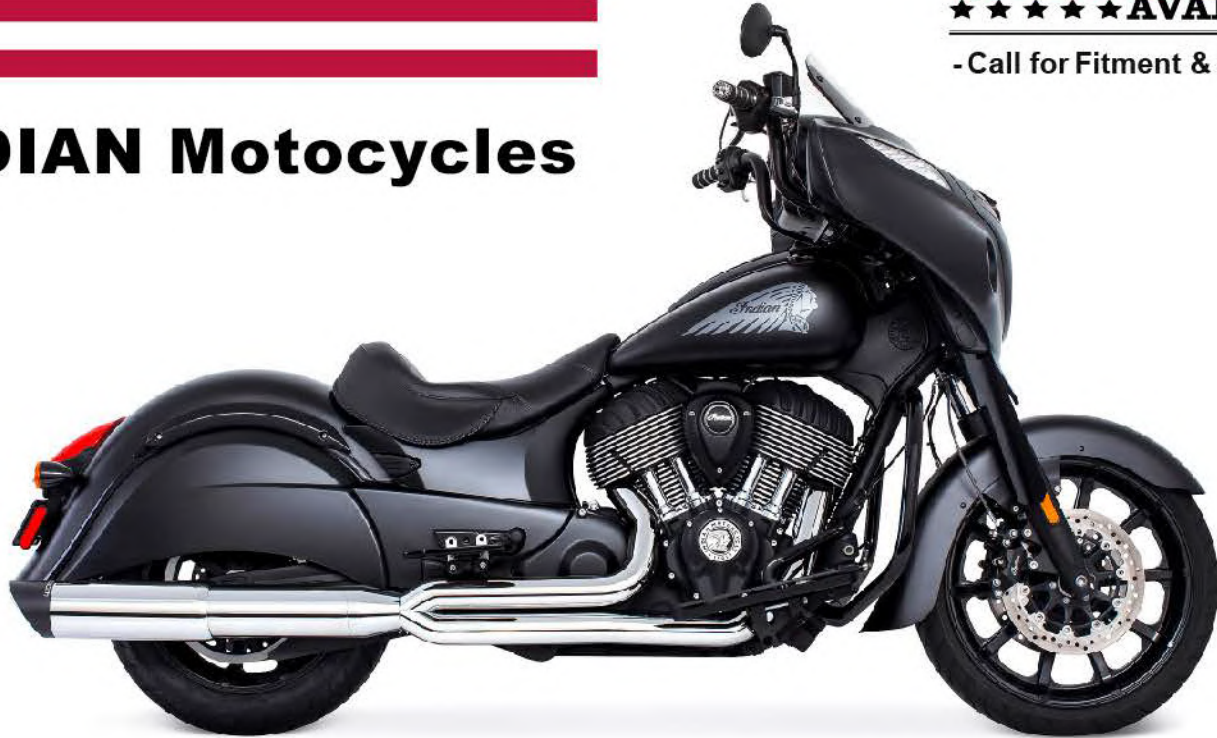
Indian Scout 4" Slip-ons - see Page 8