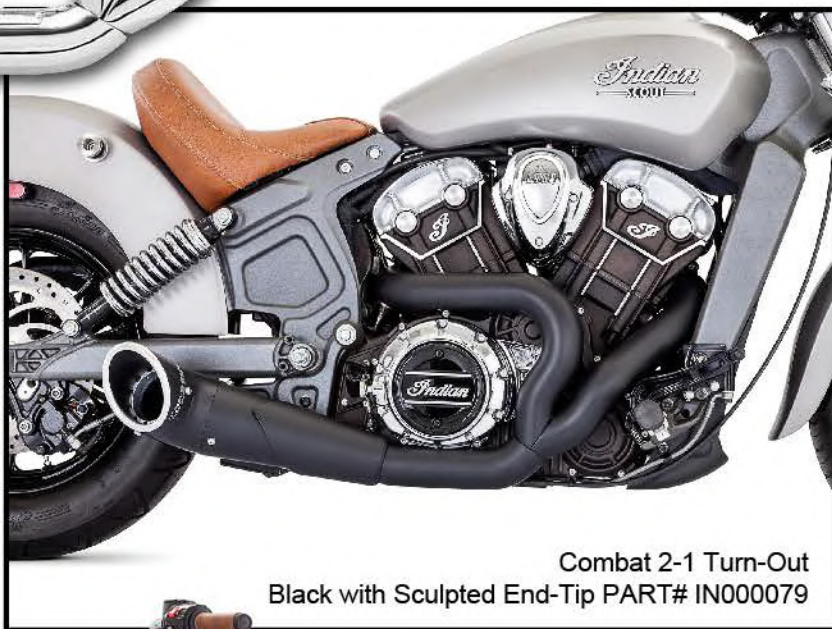
Combat 2-1 Turn-Out Black with Sculpted End-Tip PART# IN000079