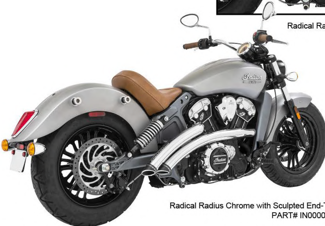
Radical Radius Chrome with Sculpted End-Tip PART# IN000075