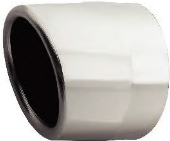
ROLLED EDGE 4"

CHROME [FP] AC00101 [TR] CALL [WPS] CALL