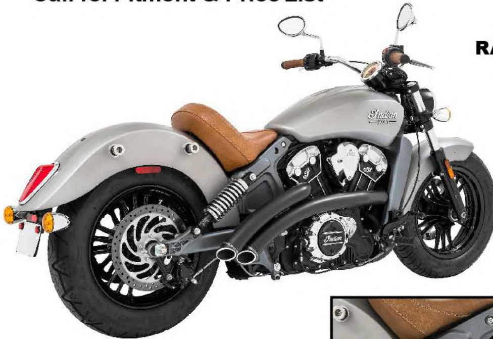
Radical Radius Black with Sculpted End-Tip PART# IN000076