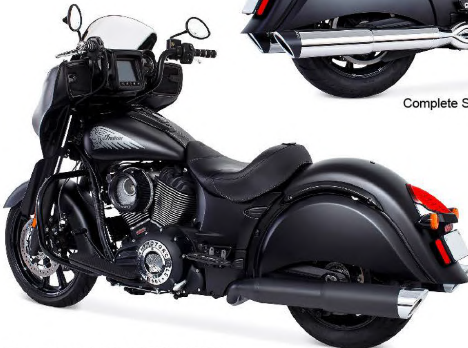
Ghost Pipe Left-Side PART# IN000135 Complete System Right-Side PART# IN000150