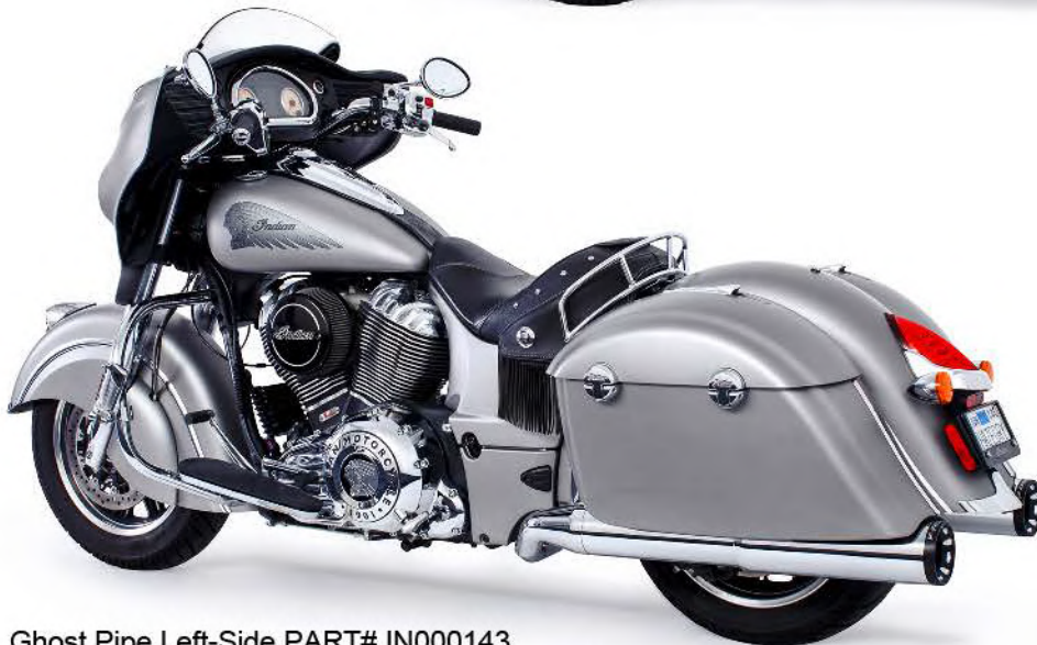
Ghost Pipe Left-Side PART# IN000143 Complete System Right-Side PART# IN000163