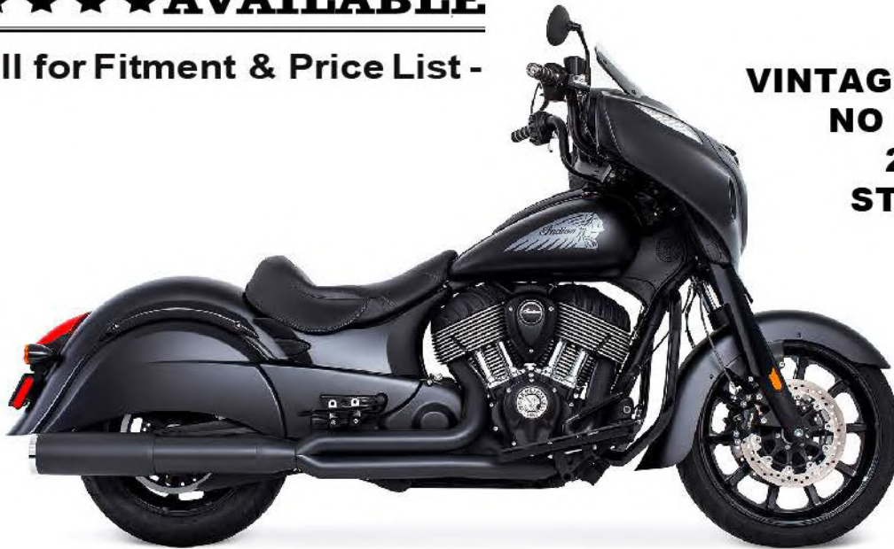
Complete System Right-Side Black with Chrome Tip PART# IN000155

INDIAN VINTAGE CLASSIC® NO HARD BAGS 2-1 with 4.5" STRAIGHT TIP