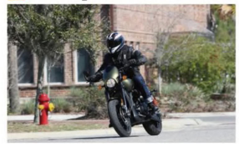
Crash Tested: HJC RPHA 11 Pro Helmet High-End HJC Lid is Comfortable, Looks Good