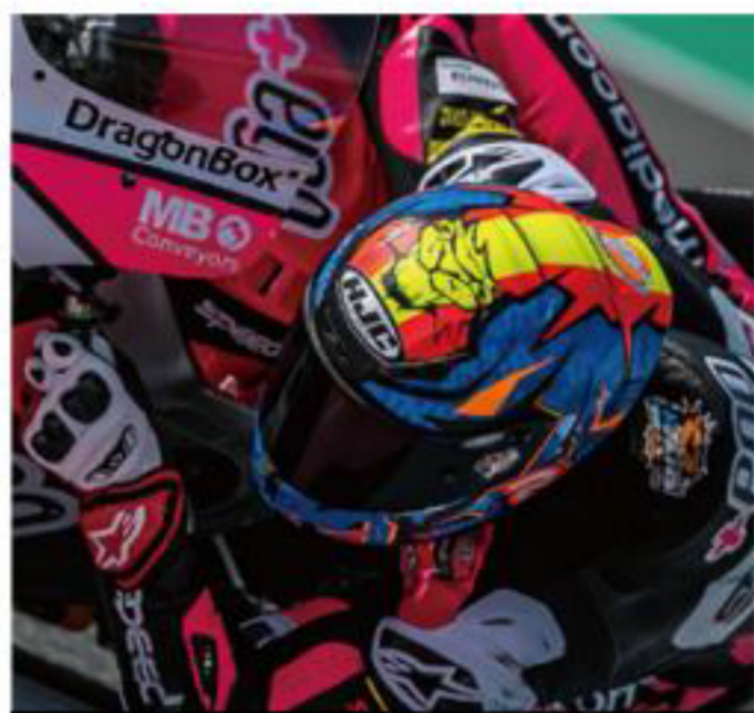
JORGE NAVARRO MOTO 2