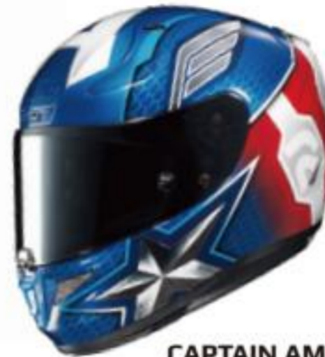
CAPTAIN AMERICA RPHA 11 PRO