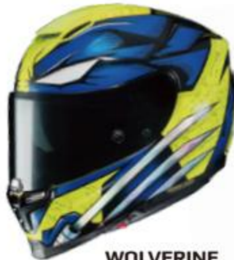
WOLVERINE RPHA 70 ST