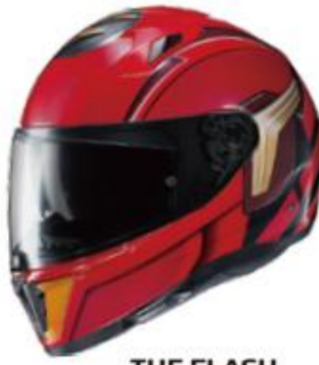
THE FLASH i70