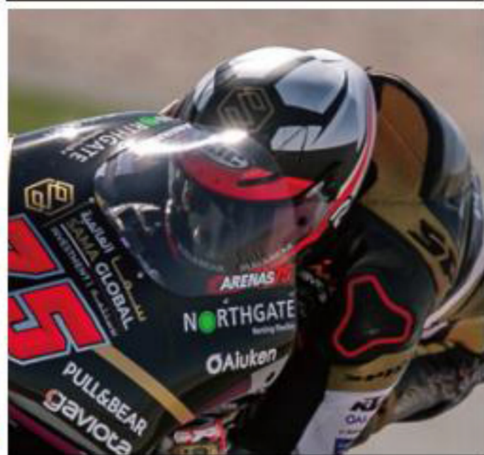
ALBERT ARENAS MOTO 3