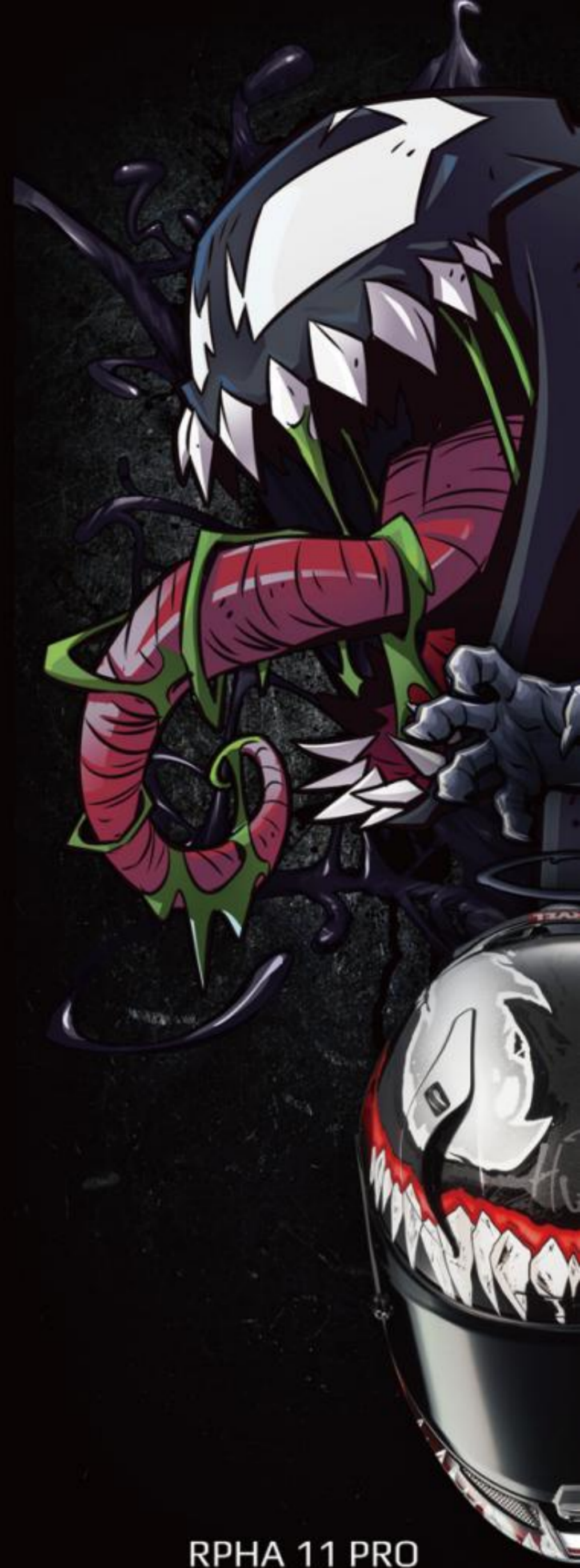
RPHA 11 PRO VENOM II

HJC launches a new graphic in the X-Men licensed helmet line.