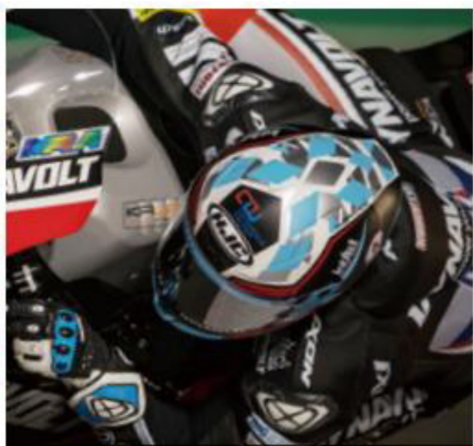
MARCEL SCHRÖETTER MOTO 2