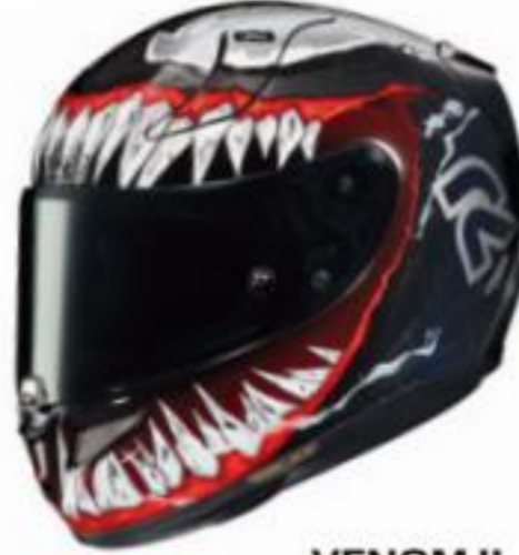
VENOM II RPHA 11 PRO