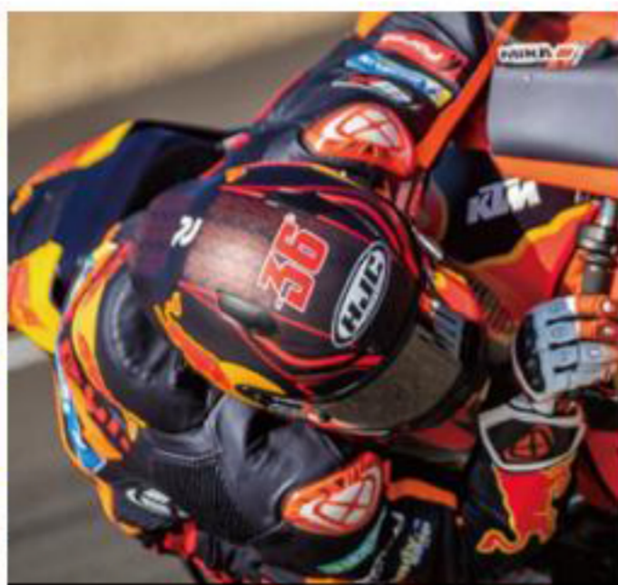
MIKA KALLIO MOTO GP