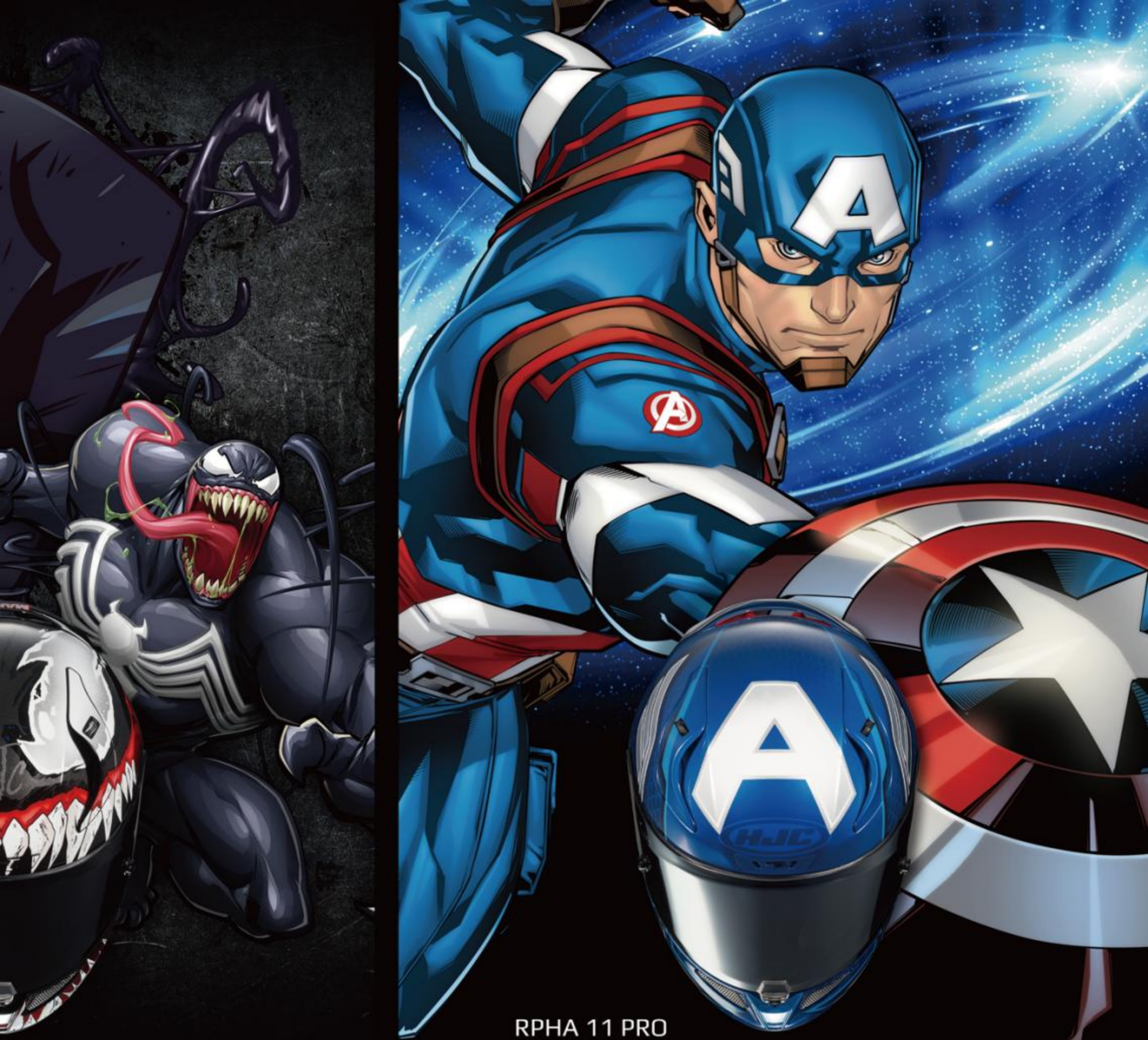
RPHA 11 PRO CAPTAIN AMERICA