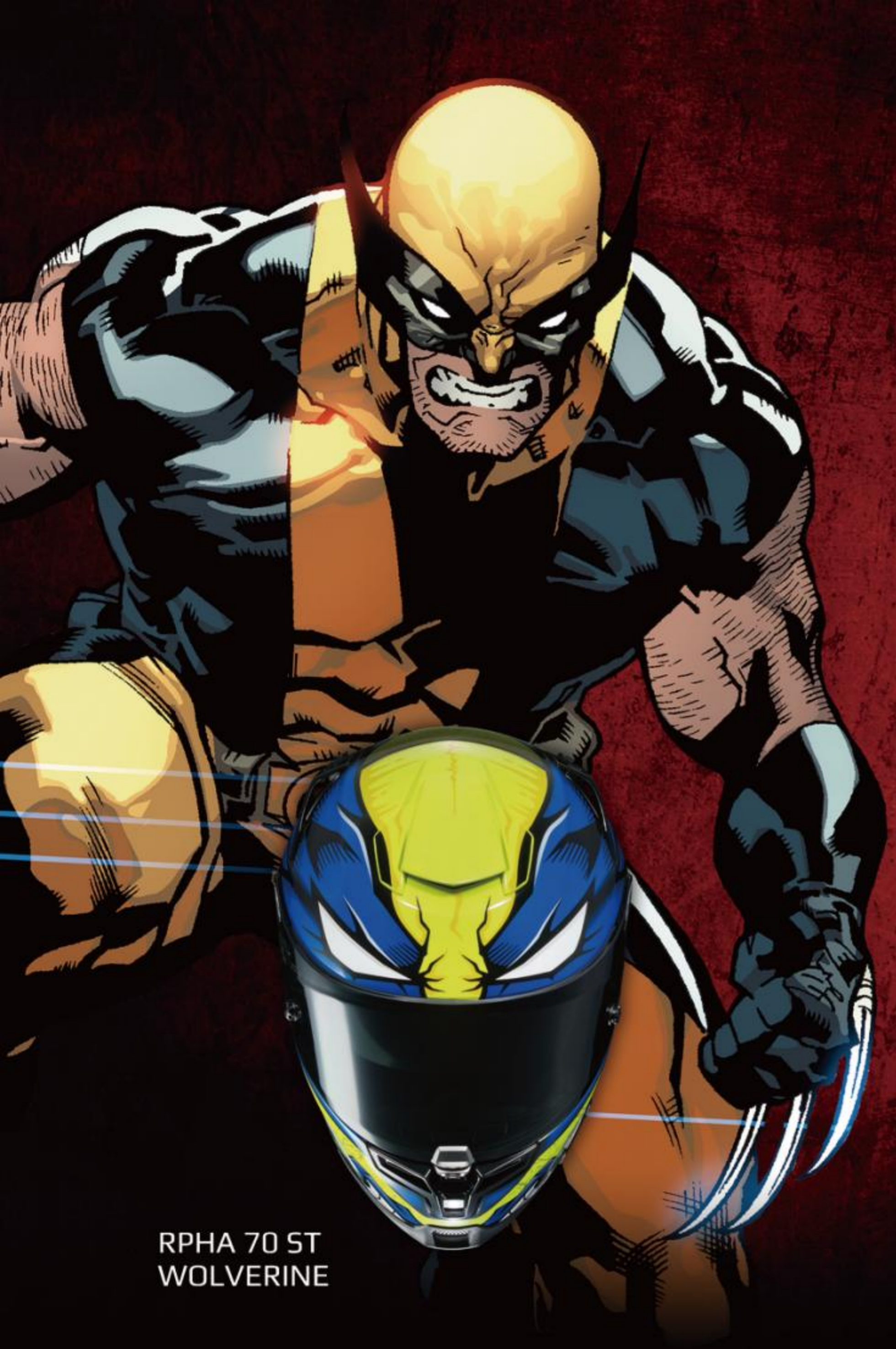
RPHA 70 ST WOLVERINE