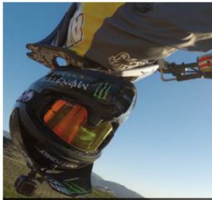
NATE ADAMS FREESTYLE