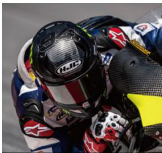
JONAS FOLGER MOTO GP