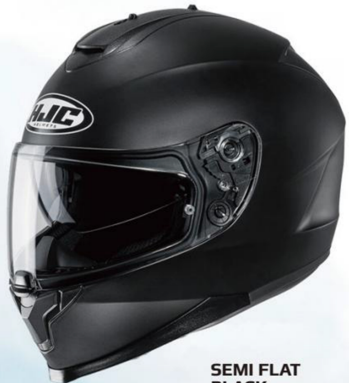
SEMI FLAT BLACK