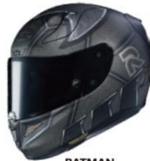
BATMAN RPHA 11 PRO