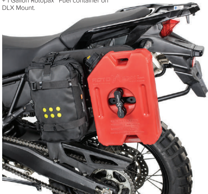
OS-PLATFORM + OS-6 ADV PACK + 1 Gallon Rotopax™ Fuel container on DLX Mount.