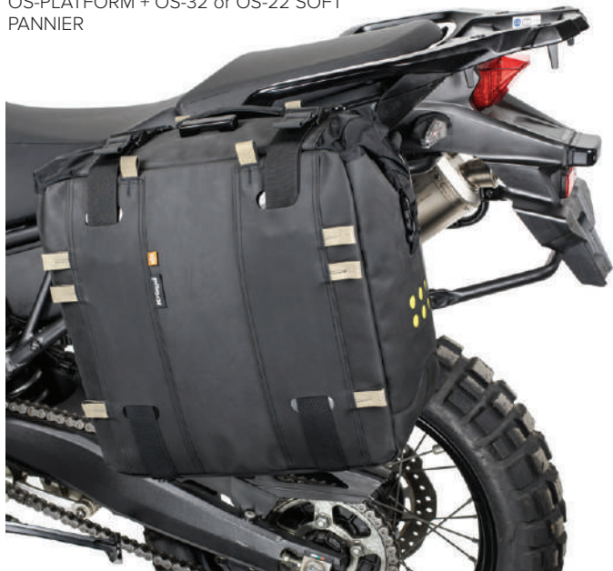
OS-PLATFORM + OS-32 or OS-22 SOFT PANNIER