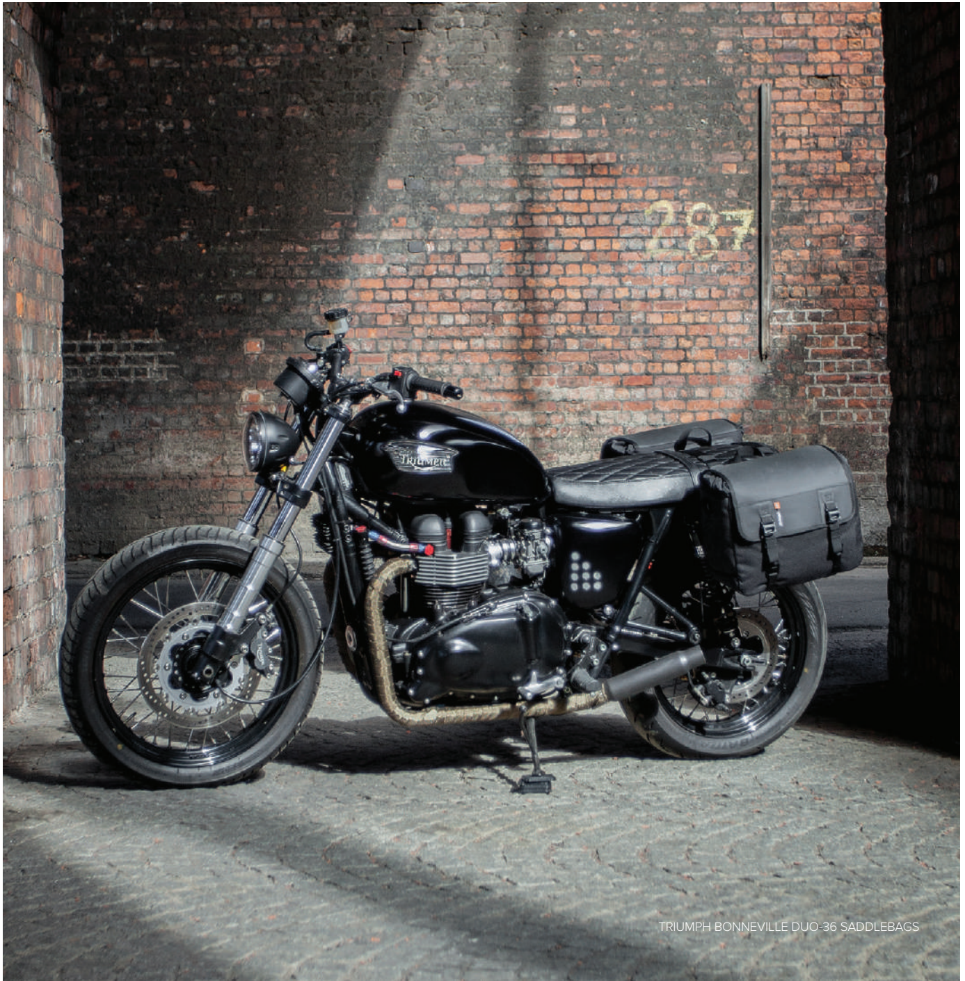
TRIUMPH BONNEVILLE DUO-36 SADDLEBAGS