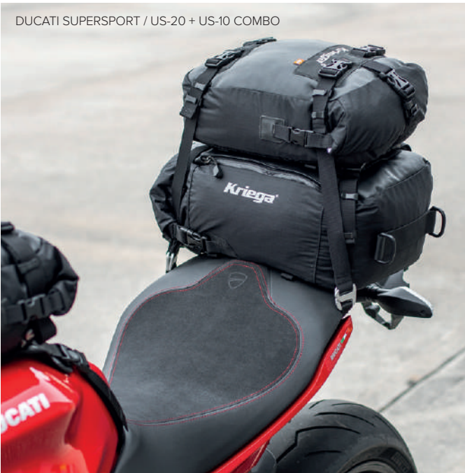
DUCATI SUPERSPORT / US-20 + US-10 COMBO