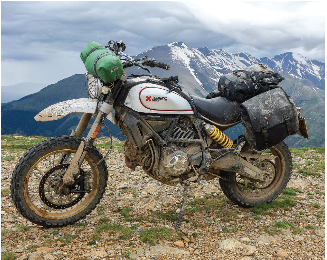
DUCATI SCRAMBLER DESERT SLED DUO-36 SADDLEBAGS mounted with Saddlebag Platforms + US-30 DRYPACK