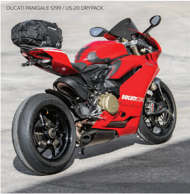
DUCATI PANIGALE 1299 / US-20 DRYPACK