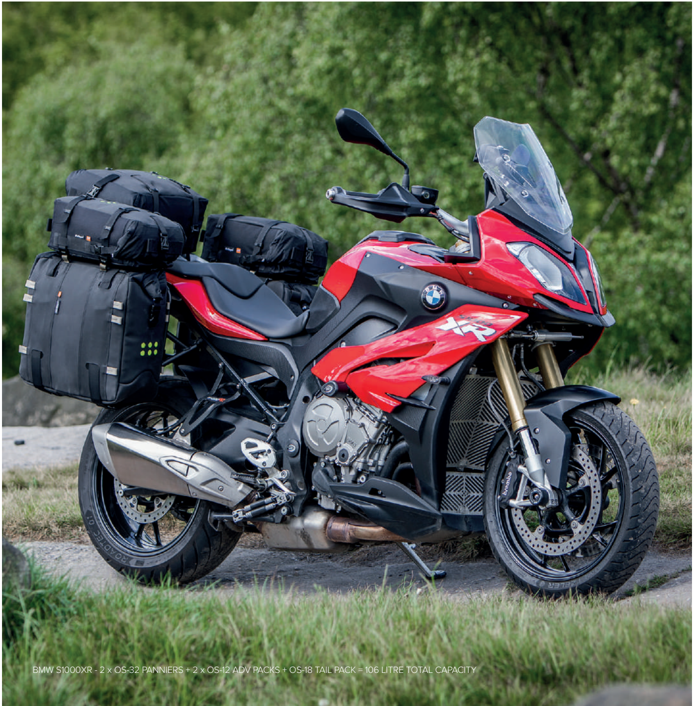
BMW S1000XR - 2 x OS-32 PANNIERS + 2 x OS-12 ADV PACKS + OS-18 TAIL PACK = 106 LITRE TOTAL CAPACITY