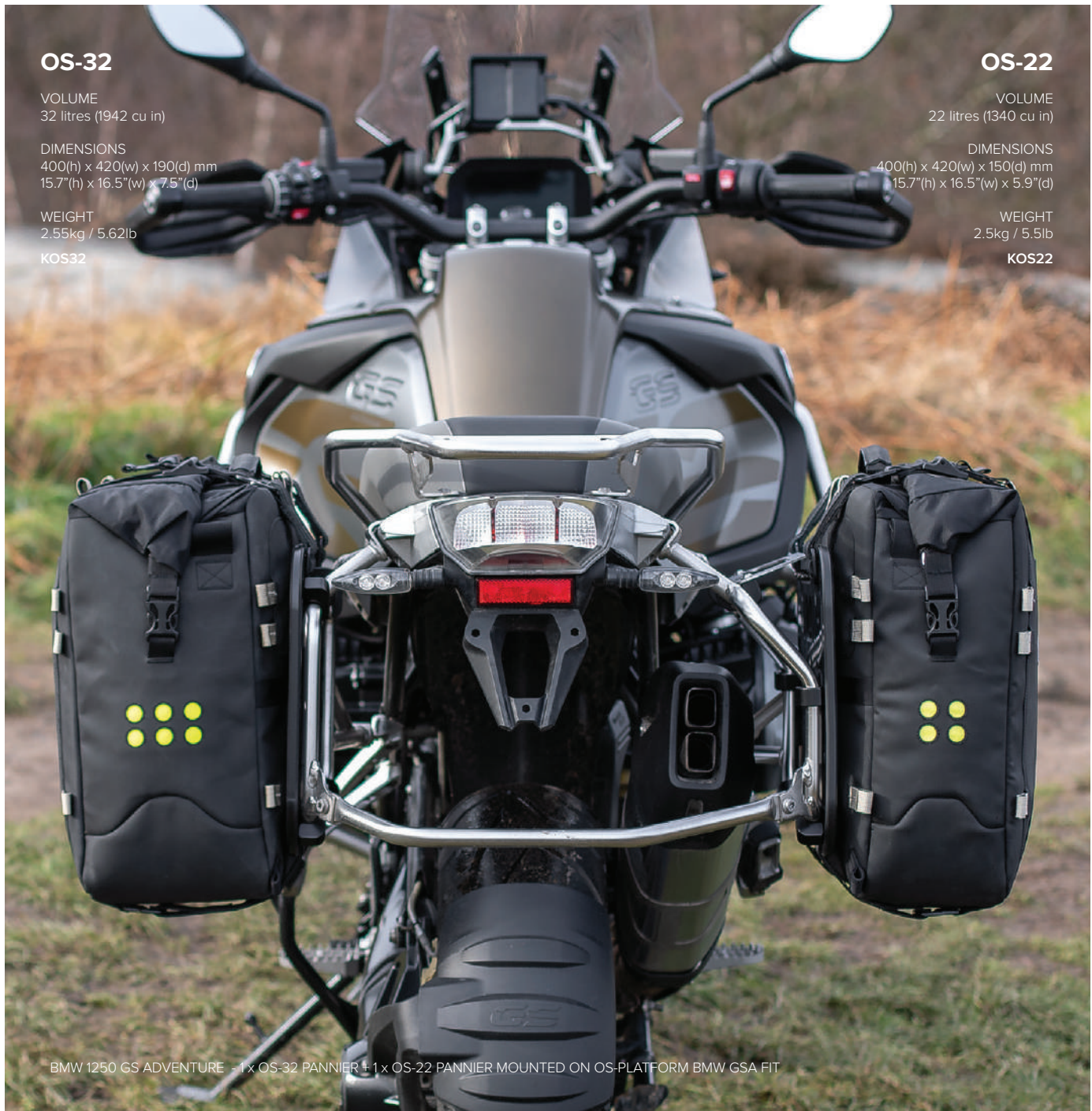
BMW 1250 GS ADVENTURE - 1x OS-32 PANNIER + 1x OS-22 PANNIER MOUNTED ON OS-PLATFORM BMW GSA FIT