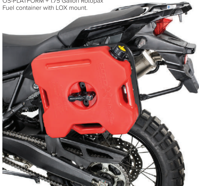
OS-PLATFORM + 1.75 Gallon Rotopax™ Fuel container with LOX mount.