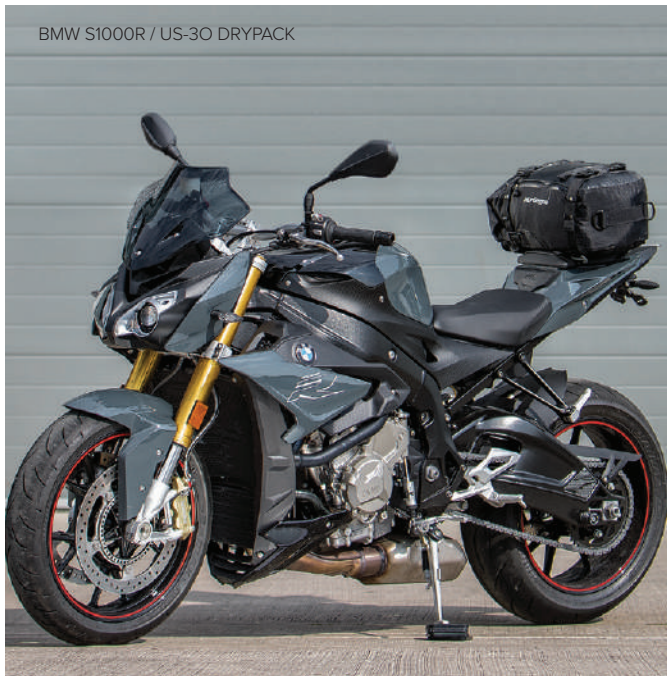
BMW S1000R / US-30 DRYPACK