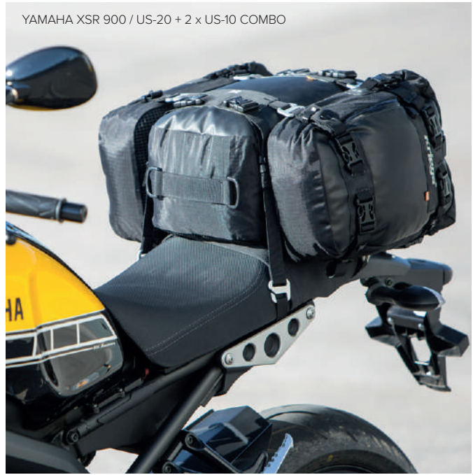
YAMAHA XSR 900 / US-20 + 2 x US-10 COMBO