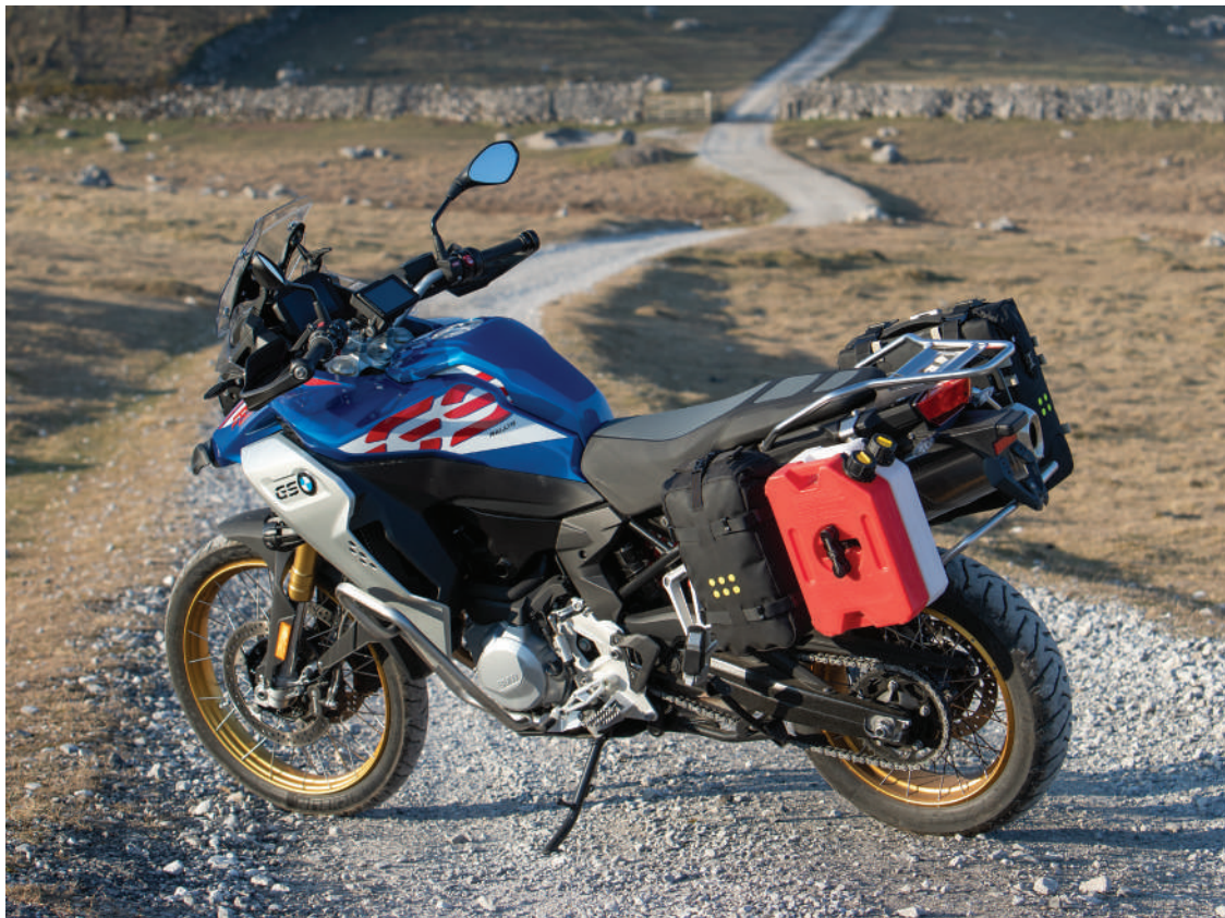
OS-12 + 1 GALLON ROTOPAX FUEL & WATER + OS-22