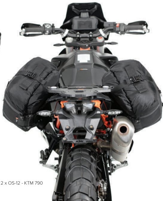
2 x OS-12 - KTM 790