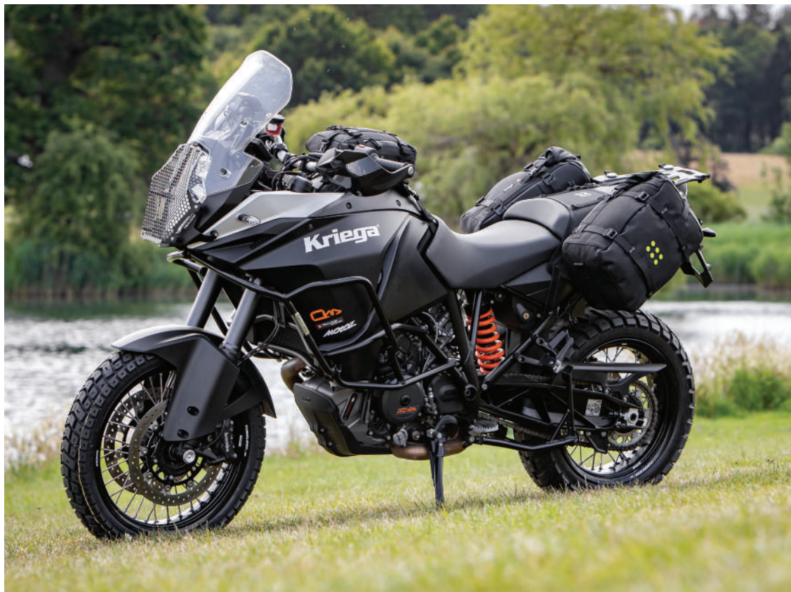
2 x OS-18 - KTM 1190