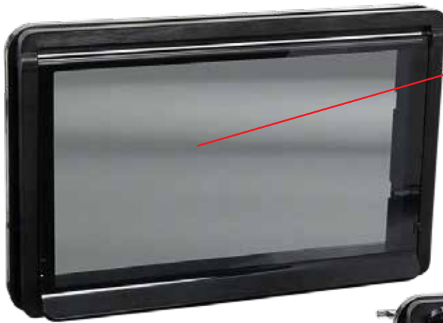
*Unit shown with closed screen