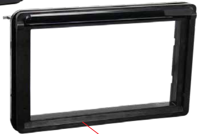
*Unit shown with open screen