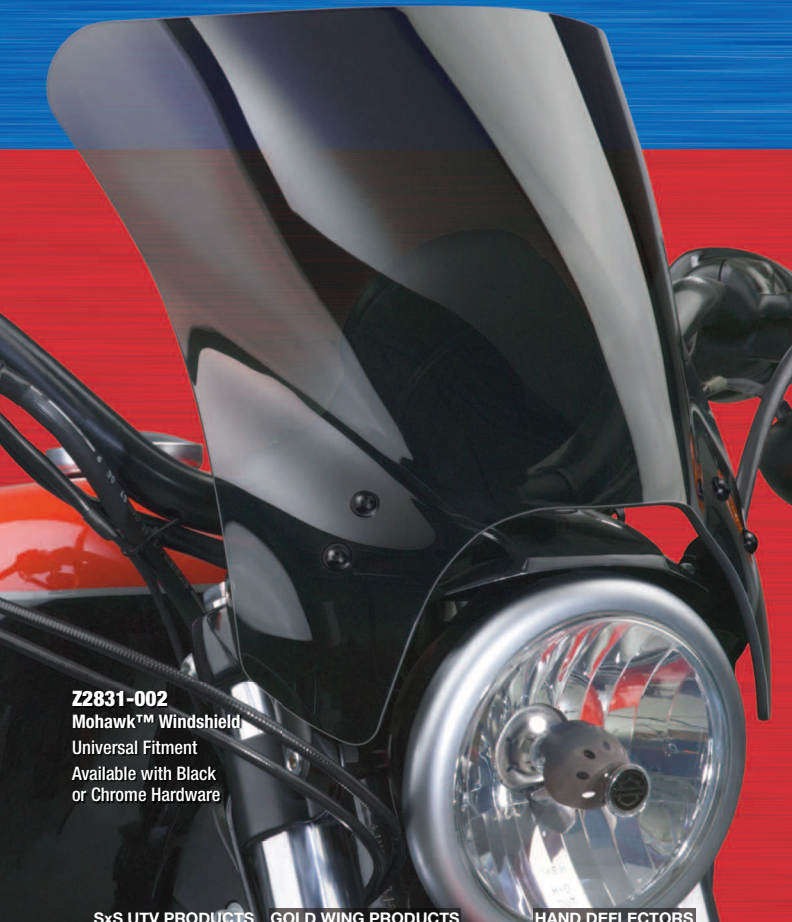
Z2831-002 Mohawk™ Windshield Universal Fitment Available with Black or Chrome Hardware