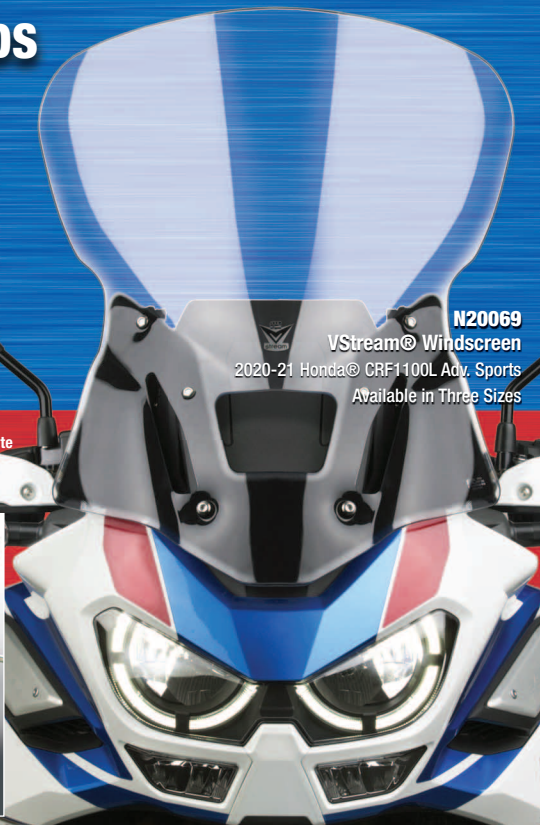
N20069 VStream® Windscreen 2020-21 Honda® CRF1100L Adv. Sports Available in Three Sizes

National Cycle 3-Year Warranty Our exclusive 3-Year Warranty covers all polycarbonate windcreens and windshields against breakage.