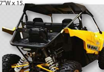
Cooler mounted on UTV