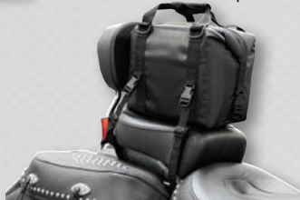
Cooler mounted on motorcycle back seat