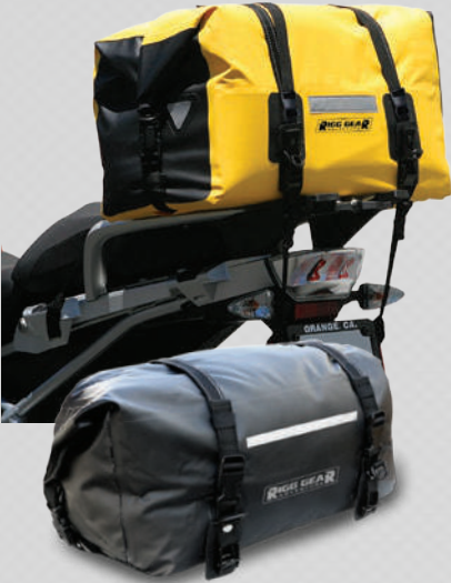
15L Ridge Roll Bag Backpack straps optional