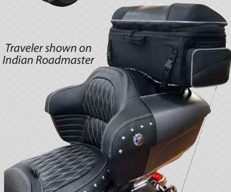
Traveler shown on Indian Roadmaster