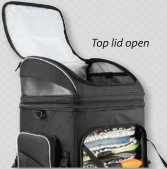
Top lid open