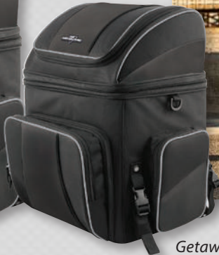
Getaway (shown on bikes above & below)