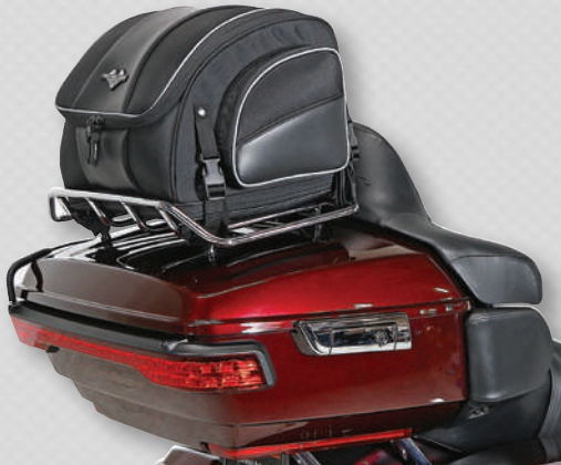
Weekender shown on H-D Tour Pak Rack