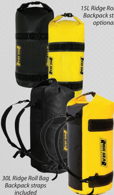
30L Ridge Roll Bag Backpack straps included