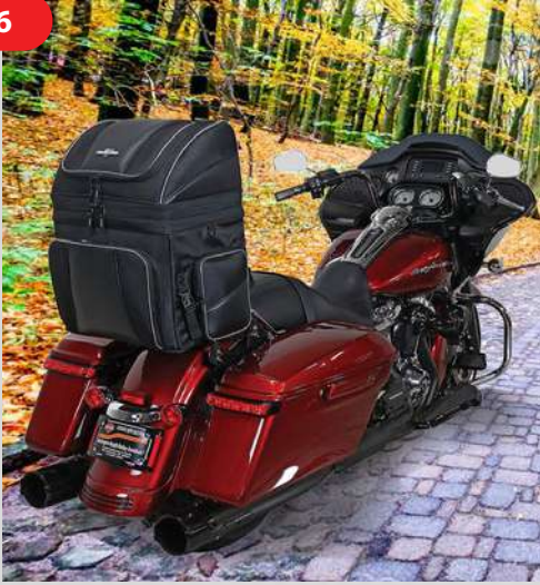
Destination bag shown above