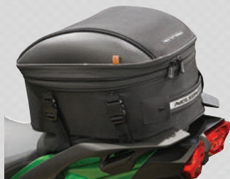
Commuter Touring Tail/Seat Bag CL-1060-ST2