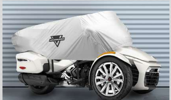
Defender Half Cover size XL shown on F3 Limited