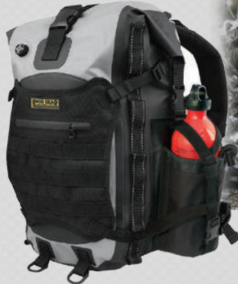
20L BACKPACK SE-3020