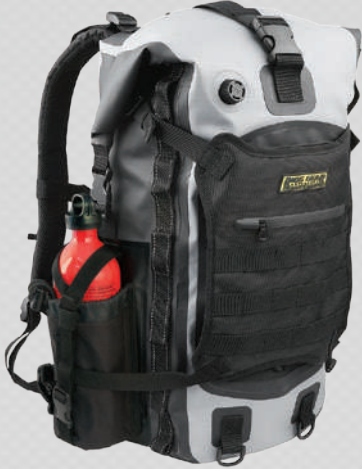
40L BACKPACK SE-3040