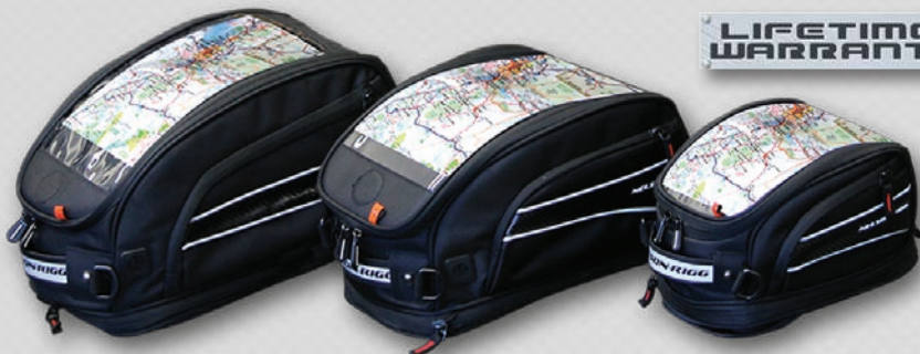
CL-2016 MG Journey XL Tank Bag