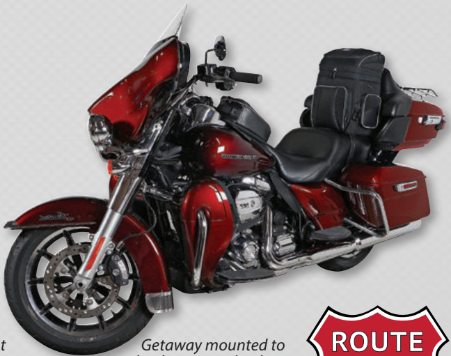
Getaway mounted to back seat as a backrest