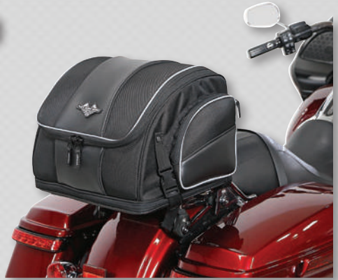
Weekender shown on Sissy Bar/Backrest