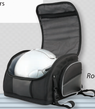
Room for a full face helmet