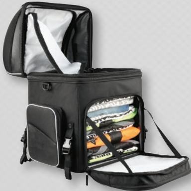
Easy front access and loading

Top compartment: 12"L x 9"W x 4"H Holds 7 Liters