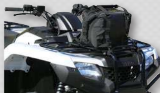
Cooler mounted on ATV