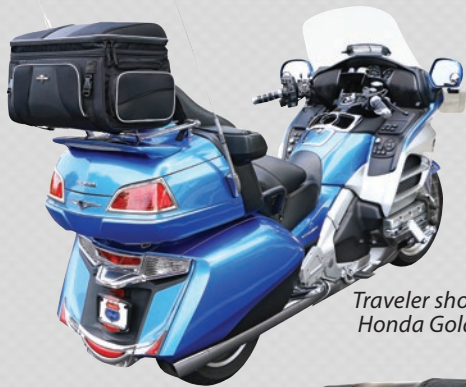
Traveler shown on Honda Goldwing