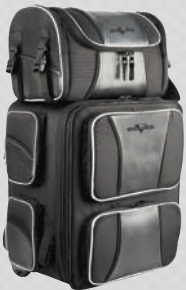
Day Trip mounted to Highway Roller