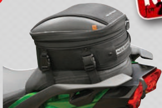
Commuter Lite Tail/Seat Bag CL-1060-R