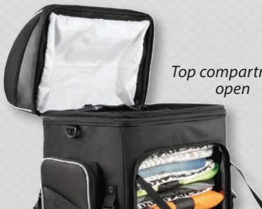
Top compartment open