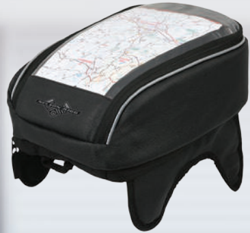
Journey shown expanded