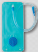
Hydration Ready (sold separately)