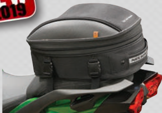
Commuter Sport Tail/Seat Bag CL-1060-S2