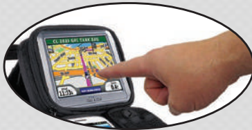
Touch Screen Device Friendly