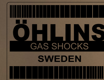
ÖHLINS RETRO BLACK