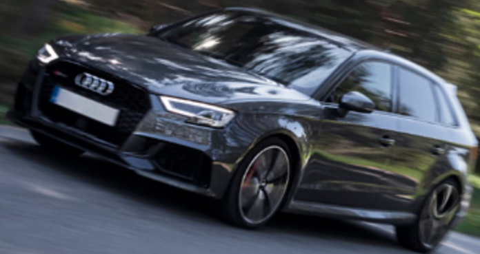
ROAD & TRACK