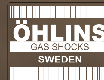
ÖHLINS RETRO WHITE