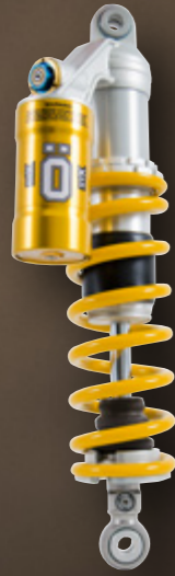
STX 46 SHOCK ABSORBER