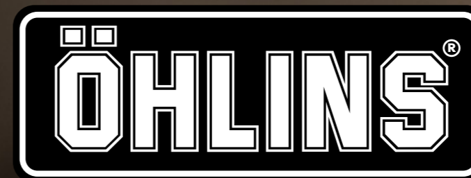
ÖHLINS BLACK/WHITE MEDIUM