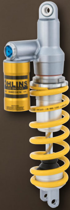
TTX FLOW WITH PDS SHOCK ABSORBER