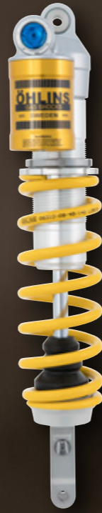
TTX FLOW SHOCK ABSORBER