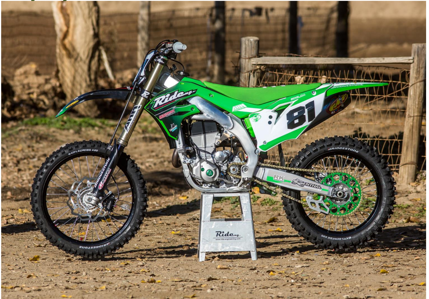
Ride Engineering 2019 KX450