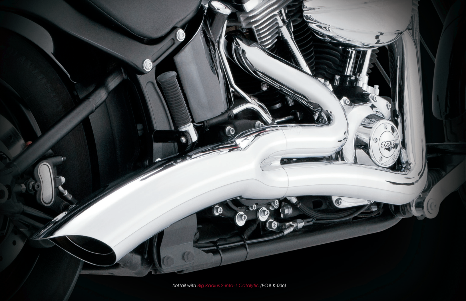
Softail with Big Radius 2-into-1 Catalytic (EO# K-006)