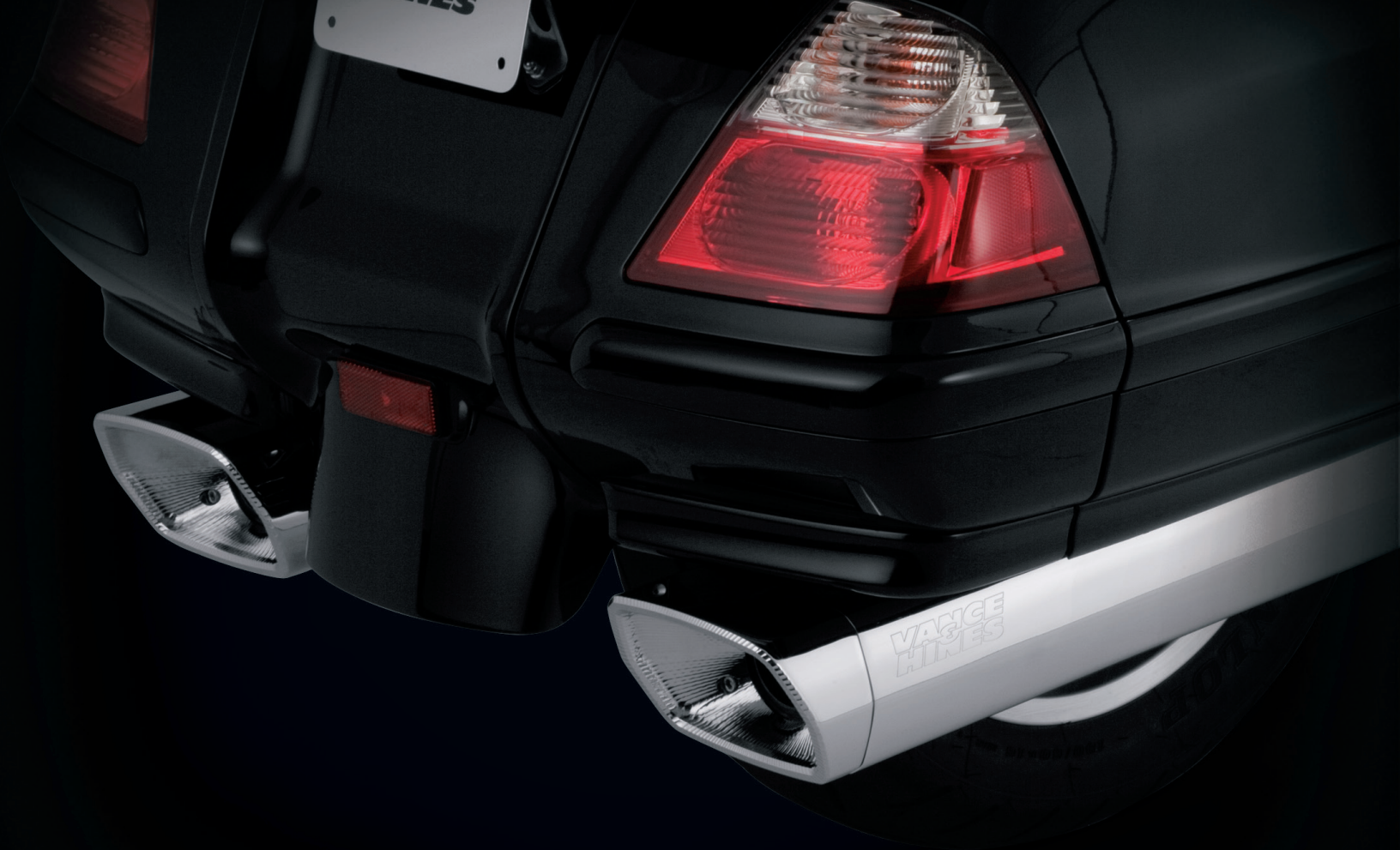
GL Monster Slip-Ons Replacement Part on 2001-2013 Gold Wing