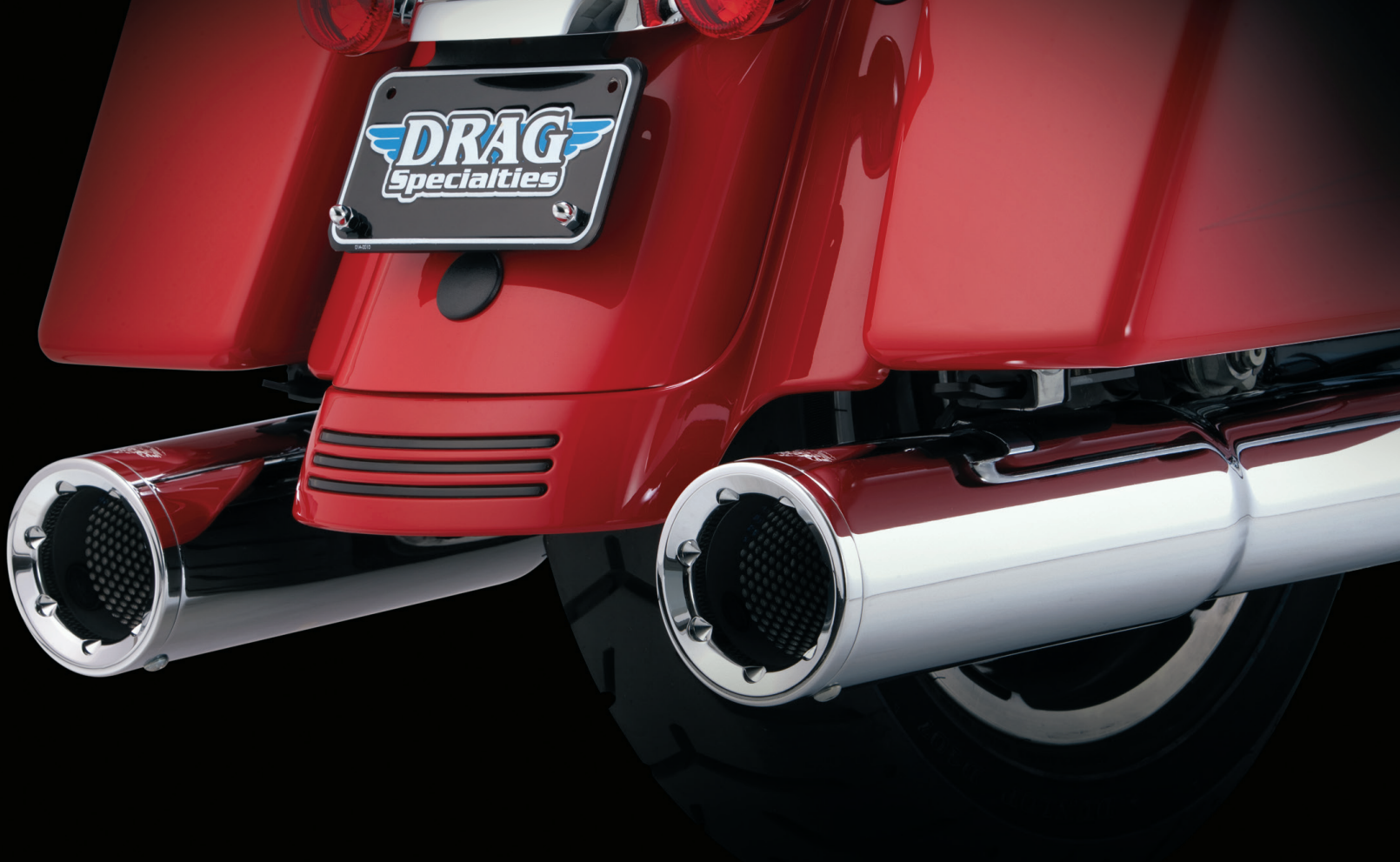
Hi-Output Slip-Ons Replacement Part on 2009-2013 Touring Models