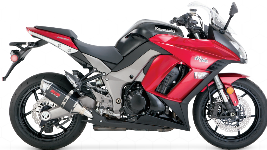
CS One Slip-Ons Replacement Part on 2010-2013 Ninja 1000

(2) If the motorcycle's stock exhaust system contains a catalytic converter in the manifold section of the stock exhaust system, then an aftermarket muffler positioned downstream from the catalytic converter (i.e. cat-back) is a replacement part as long as the part does not remove or replace any emission control equipment originally attached to the stock exhaust system.