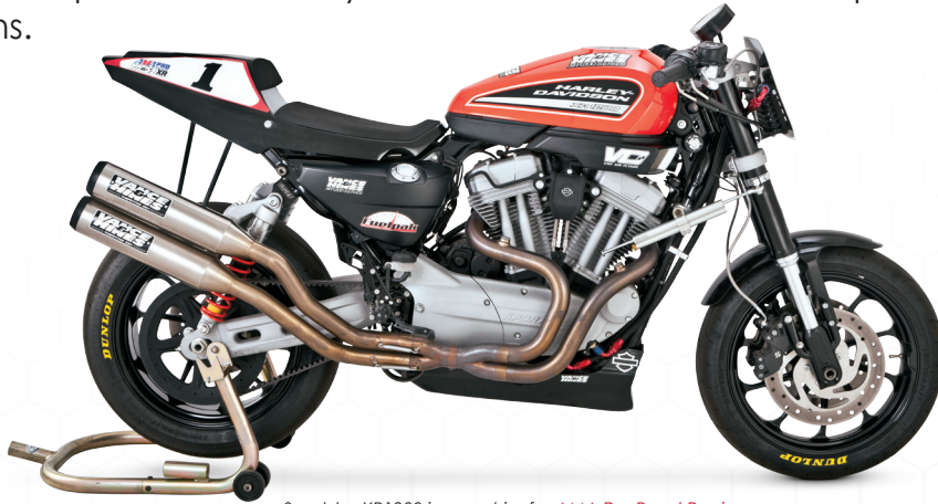
Sportster XR1200 in race trim for AMA Pro Road Racing

Record Keeping- California dealers should ensure that each sale of a Competition Use Only Part to a customer in California is to be used for closed course competition only, and keep records of the same. Likewise, California dealers exporting Competition Use Only Parts out of state should keep records of such transactions.