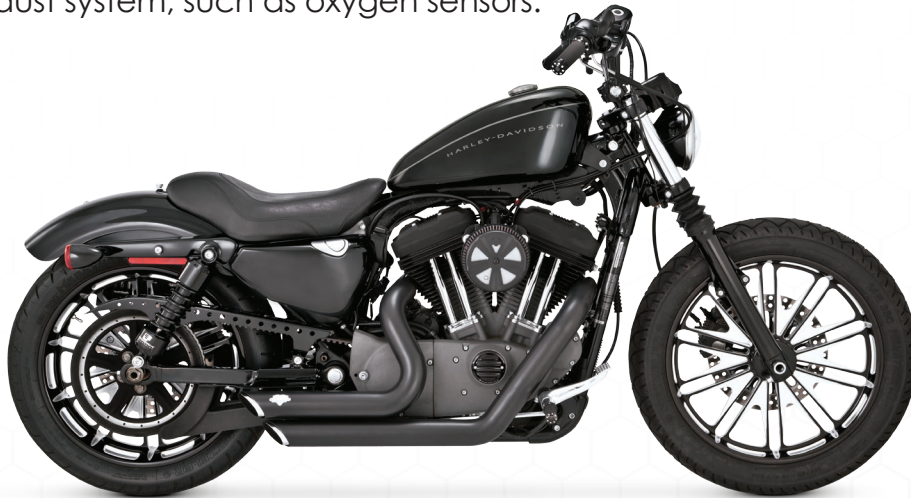
Shortshots Staggered Black Replacement Part on 2006-2013 Sportster

(1) If the motorcycle's stock exhaust system does not contain a catalytic converter, then an aftermarket exhaust part is a replacement part as long as the part does not remove or replace any emission control equipment originally attached to the stock exhaust system, such as oxygen sensors.