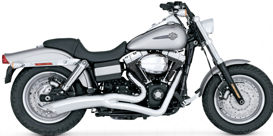
Dyna with Big Radius 2-into-1 Catalytic (EO# K-006)

Executive Order Parts are aftermarket parts that ARB has evaluated and determined do not adversely impact emissions, and thereby are granted an Executive Order (EO), which allows the part to be sold and used on motorcycles specified in the EO. Any aftermarket exhaust system that replaces or otherwise impacts emission control equipment, including catalytic converters, requires an EO to be sold and used on a motorcycle used on or off a public highway.