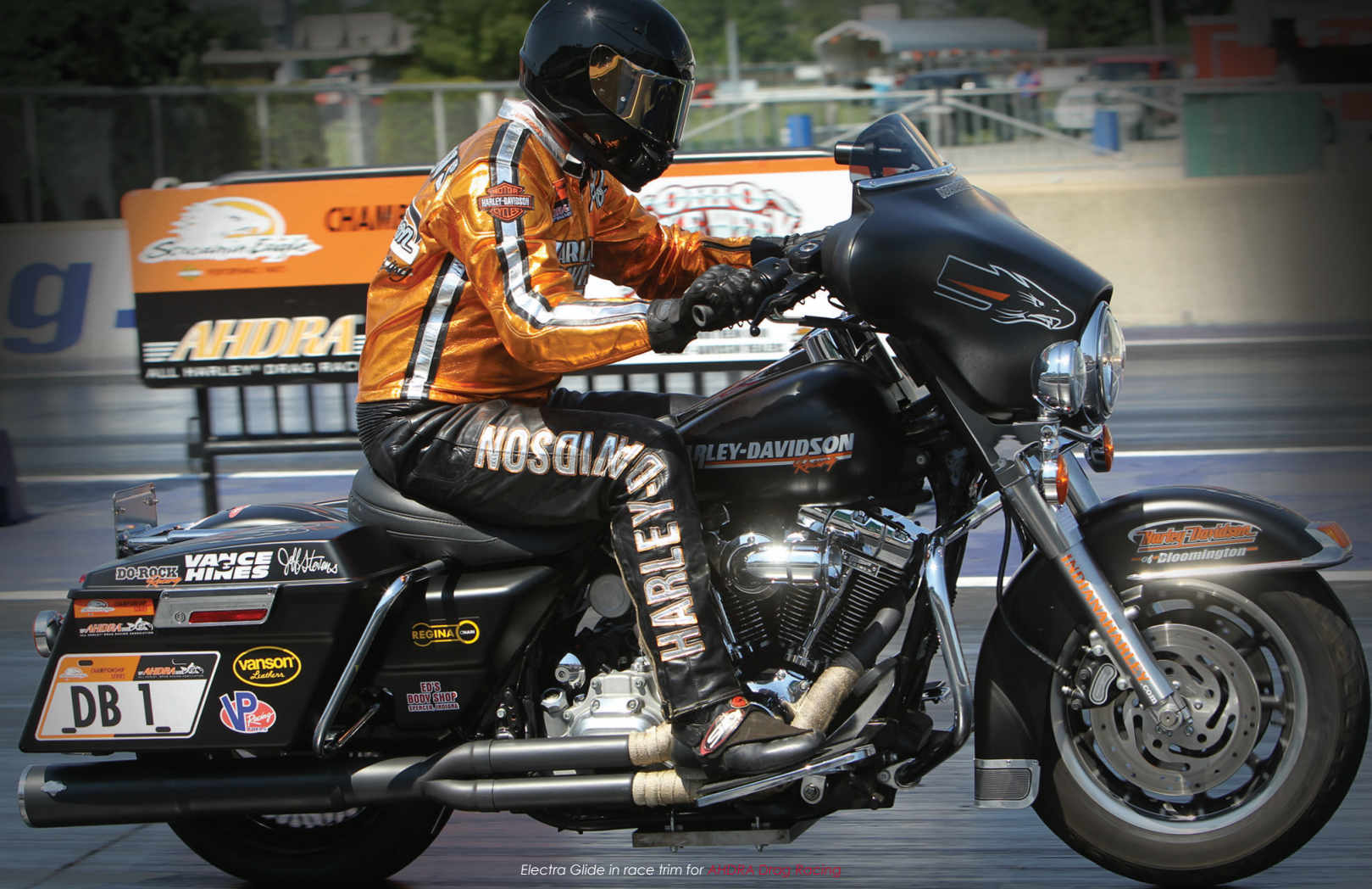
Electra Glide in race trim for AHDRA Drag Racing