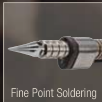
Fine Point Soldering