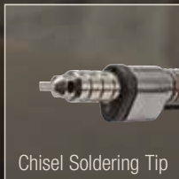
Chisel Soldering Tip